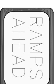
Road Signage Not to Scale

© Ordnance Survey/Ireland. All Rights Reserved. Licence number 2017/24/CMAI/FingalCountyCouncil