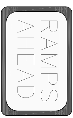
Road Signage Not to Scale

Fingal County Council Operations Department