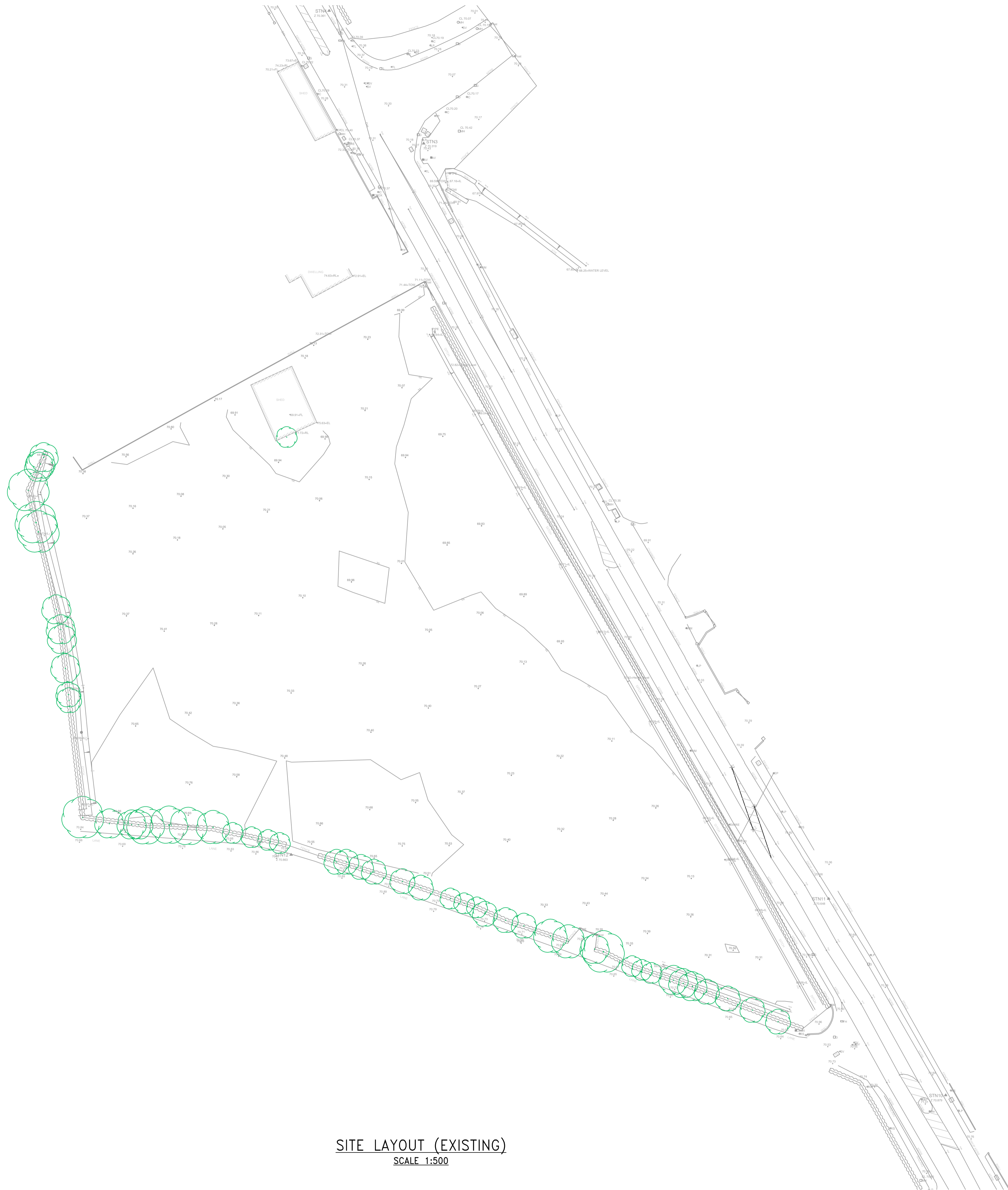
SITE LAYOUT (EXISTING) SCALE 1:500

GENERAL NOTES: 1. ALL DIMENSIONS AND LEVELS TO BE VERIFIED ON SITE PRIOR TO COMMENCEMENT OF THE WORKS. ANY DISCREPANCIES TO BE REPORTED TO THE ENGINEER. 2. THIS DRAWING IS TO BE READ IN CONJUNCTION WITH THE RELEVANT ARCHITECT'S AND CIVIL DRAWINGS.