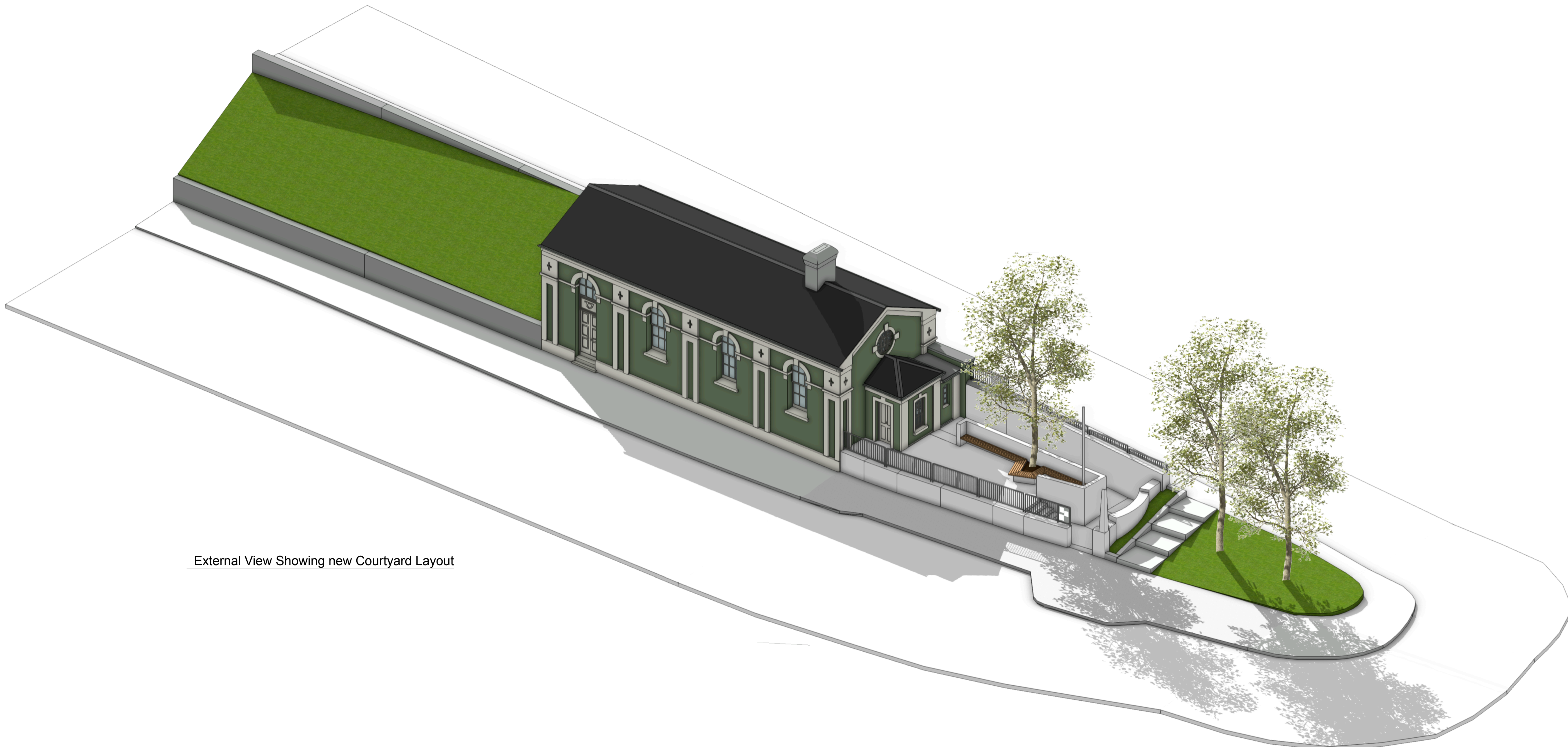
External View Showing new Courtyard Layout

The proposal involves retaining existing painted signage on the western elevation and external plaques. The provision of new high quality metal feature signage at the western boundary will allow clear and easy identification of the tourist office use and panel on new railings will allow for changing local information to be accommodated. The exterior of the building will be repainted in an appropriate colour scheme on completion.