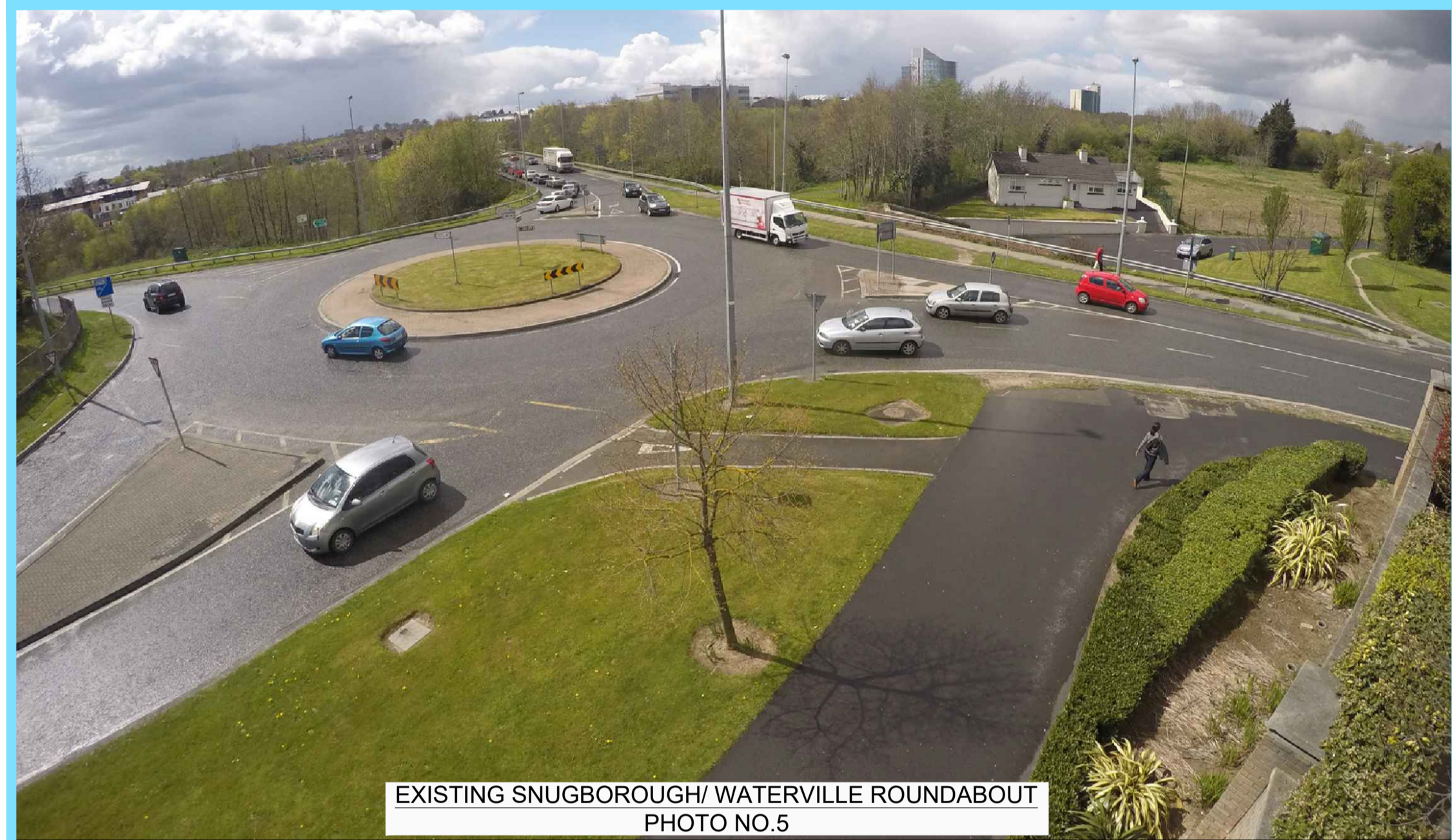
EXISTING SNUGBOROUGH / WATERVILLE ROUNDABOUT PHOTO NO.5