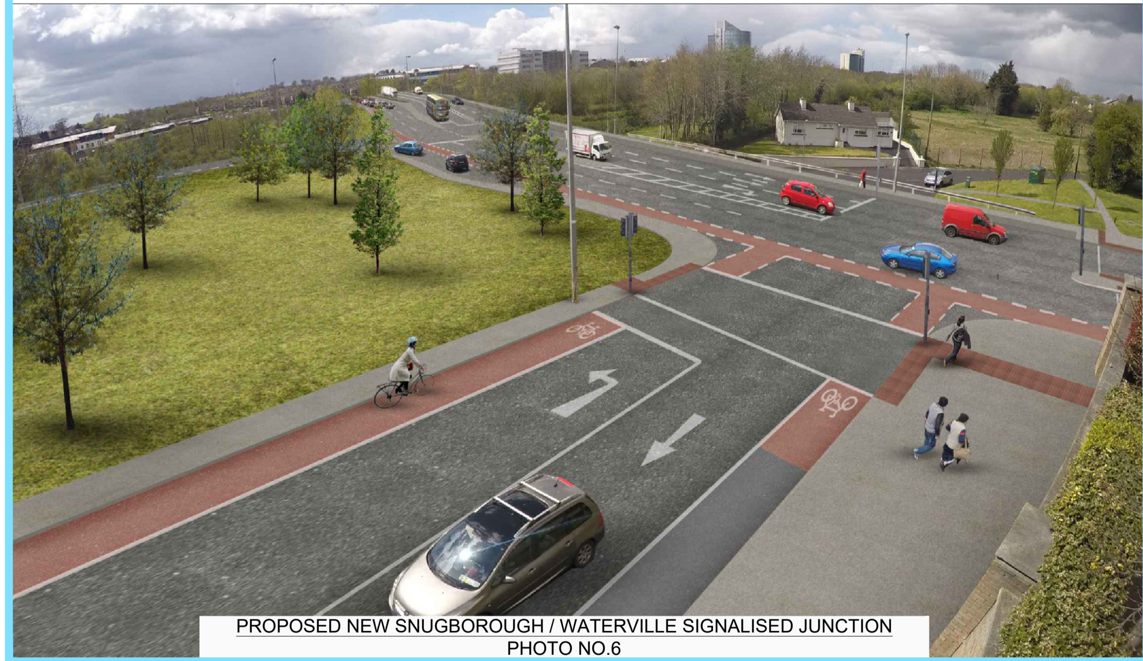
PROPOSED NEW SNUGBOROUGH / WATERVILLE SIGNALISED JUNCTION PHOTO NO.6