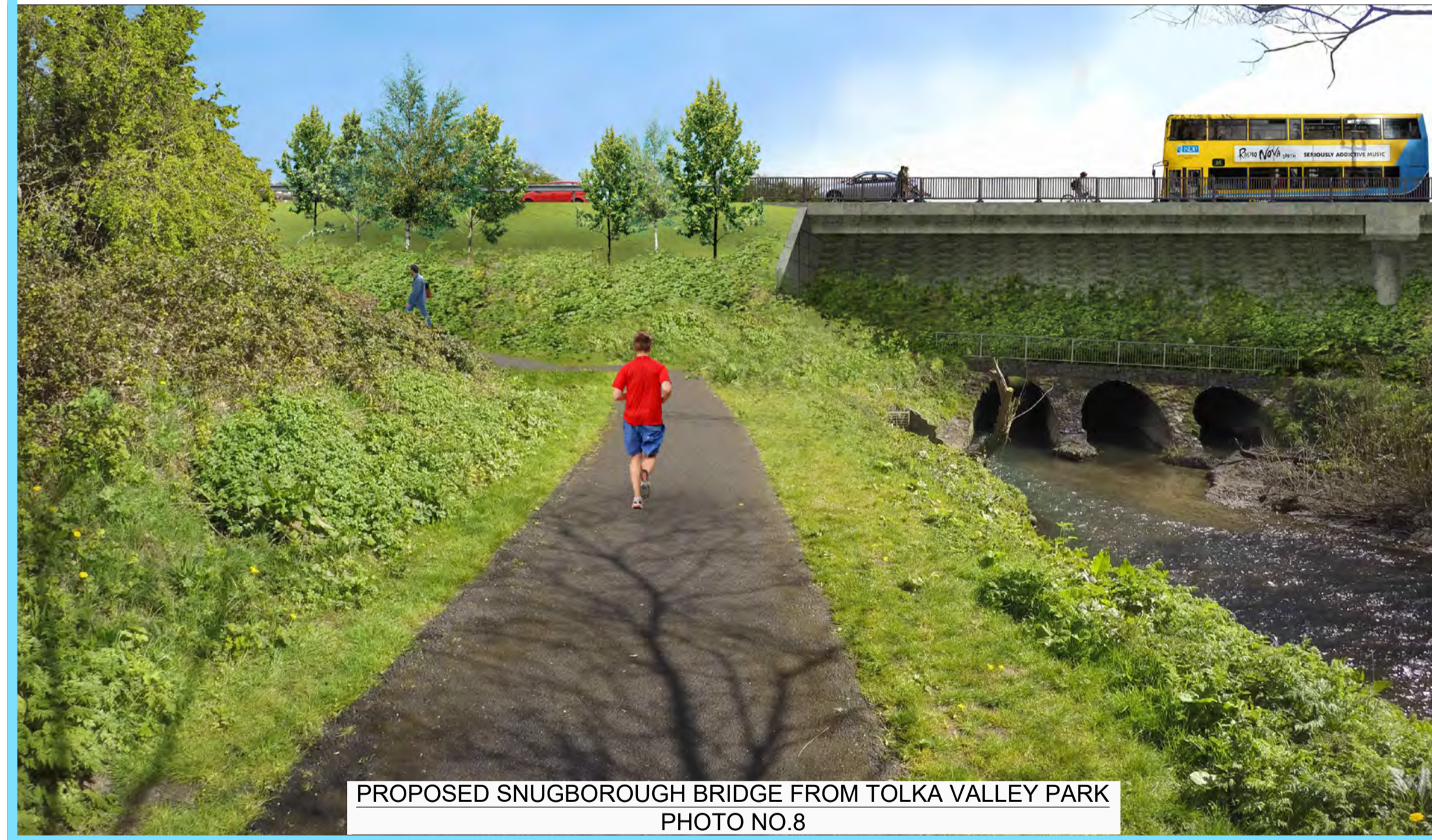
PROPOSED SNUGBOROUGH BRIDGE FROM TOLKA VALLEY PARK PHOTO NO.8