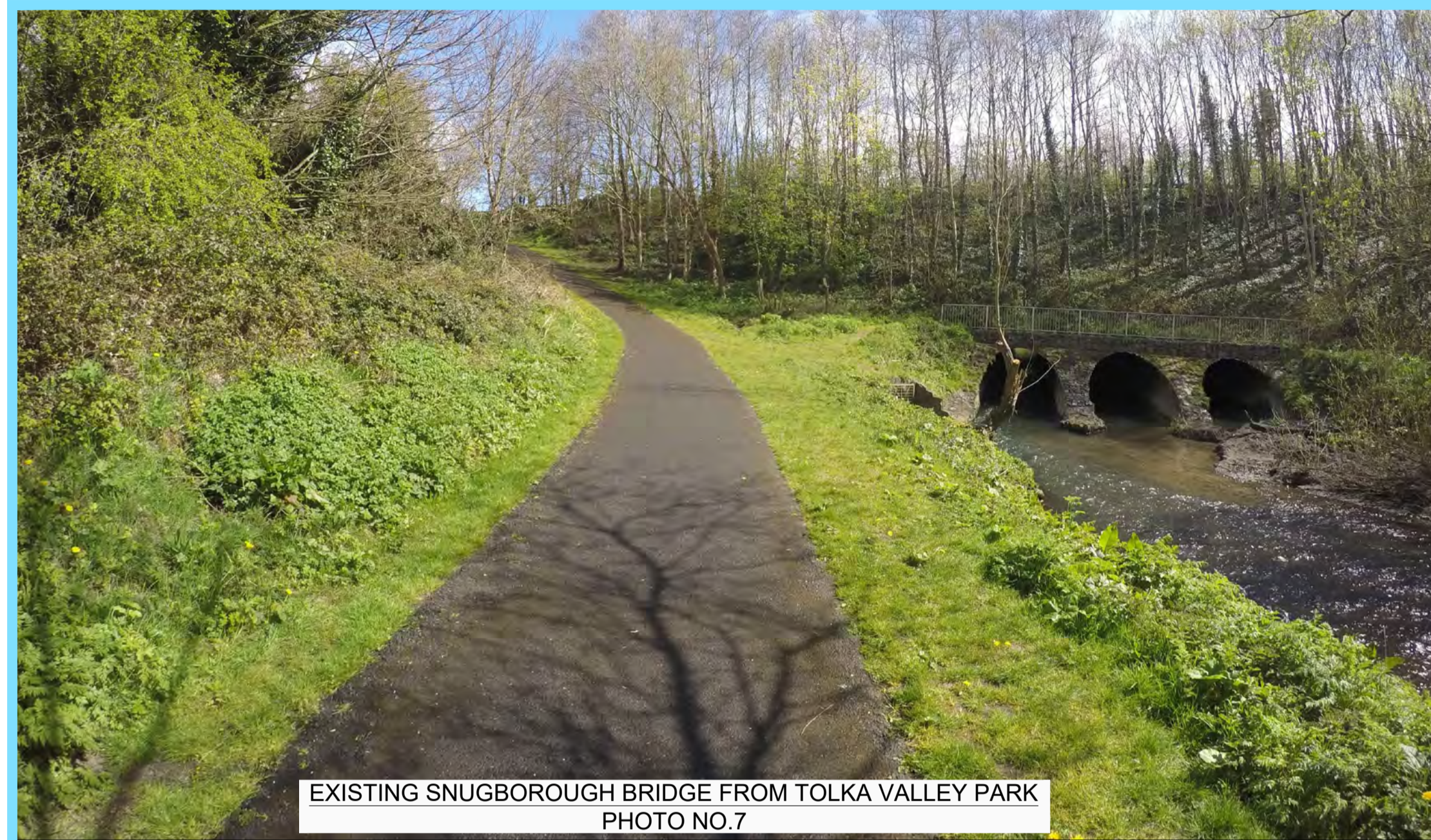
EXISTING SNUGBOROUGH BRIDGE FROM TOLKA VALLEY PARK PHOTO NO.7