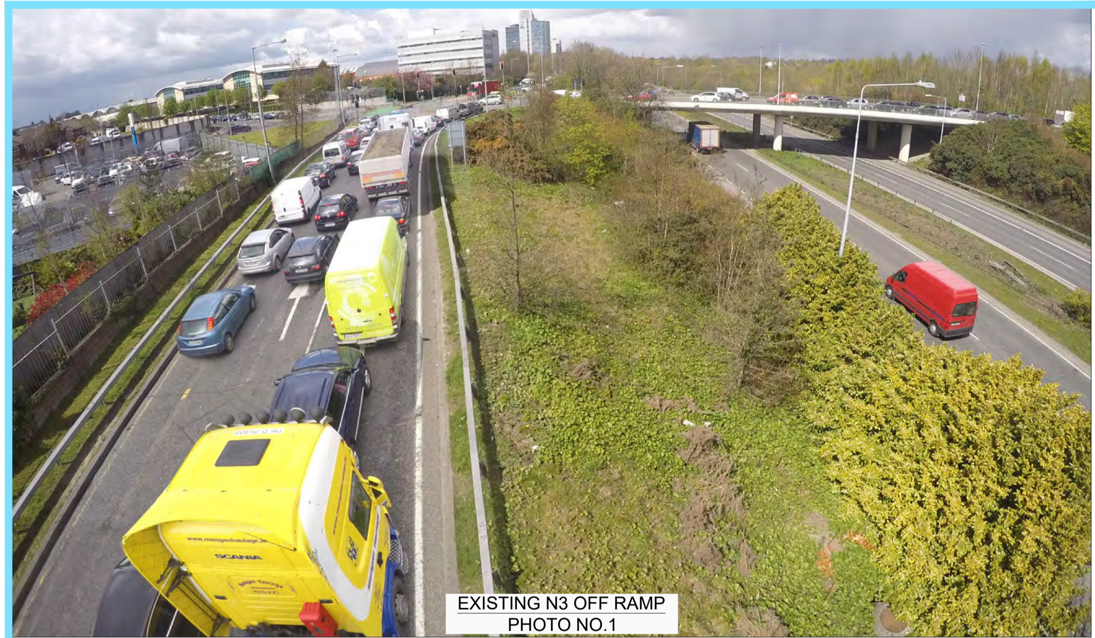
EXISTING N3 OFF RAMP PHOTO NO.1