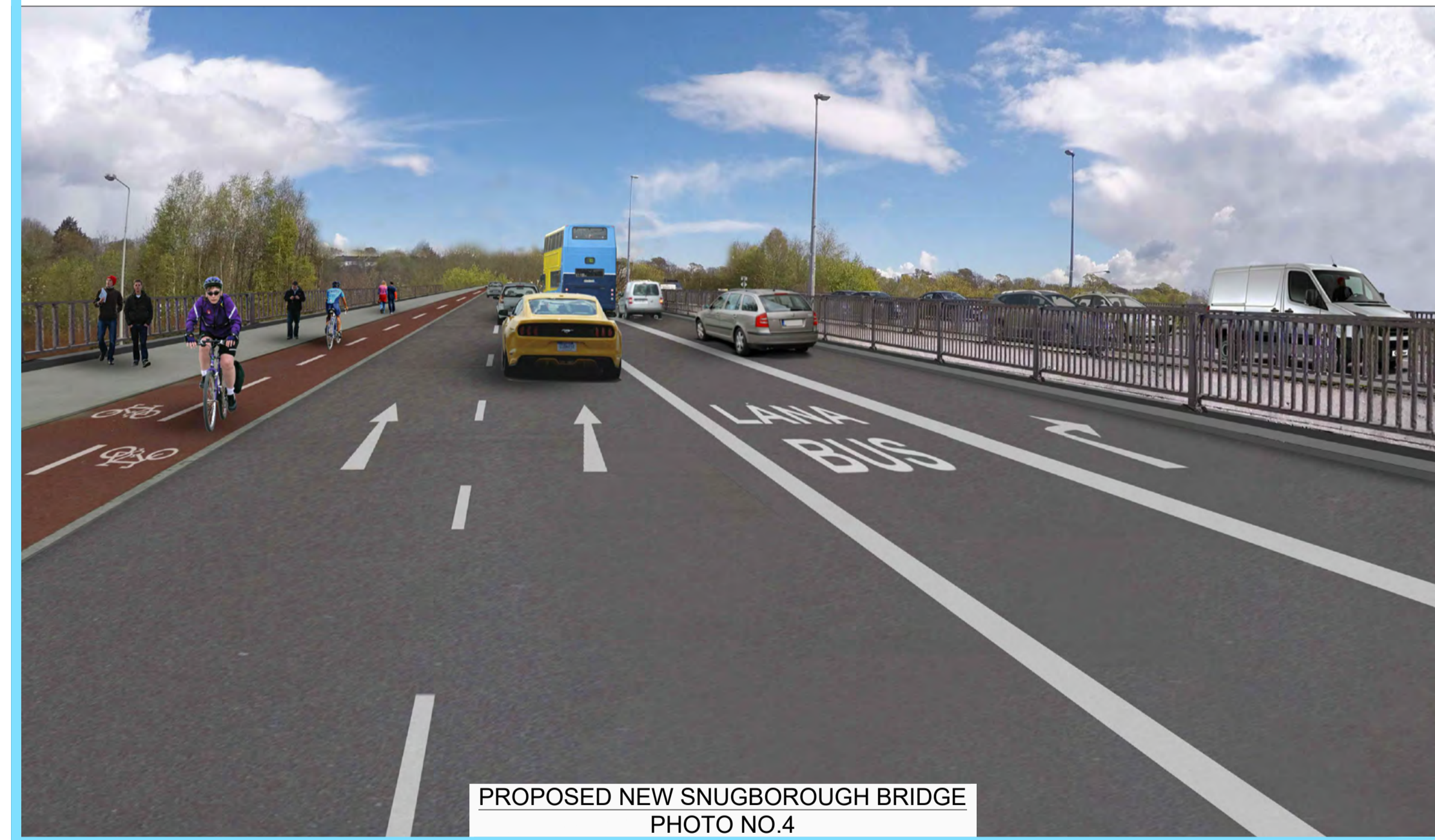
PROPOSED NEW SNUGBOROUGH BRIDGE PHOTO NO.4