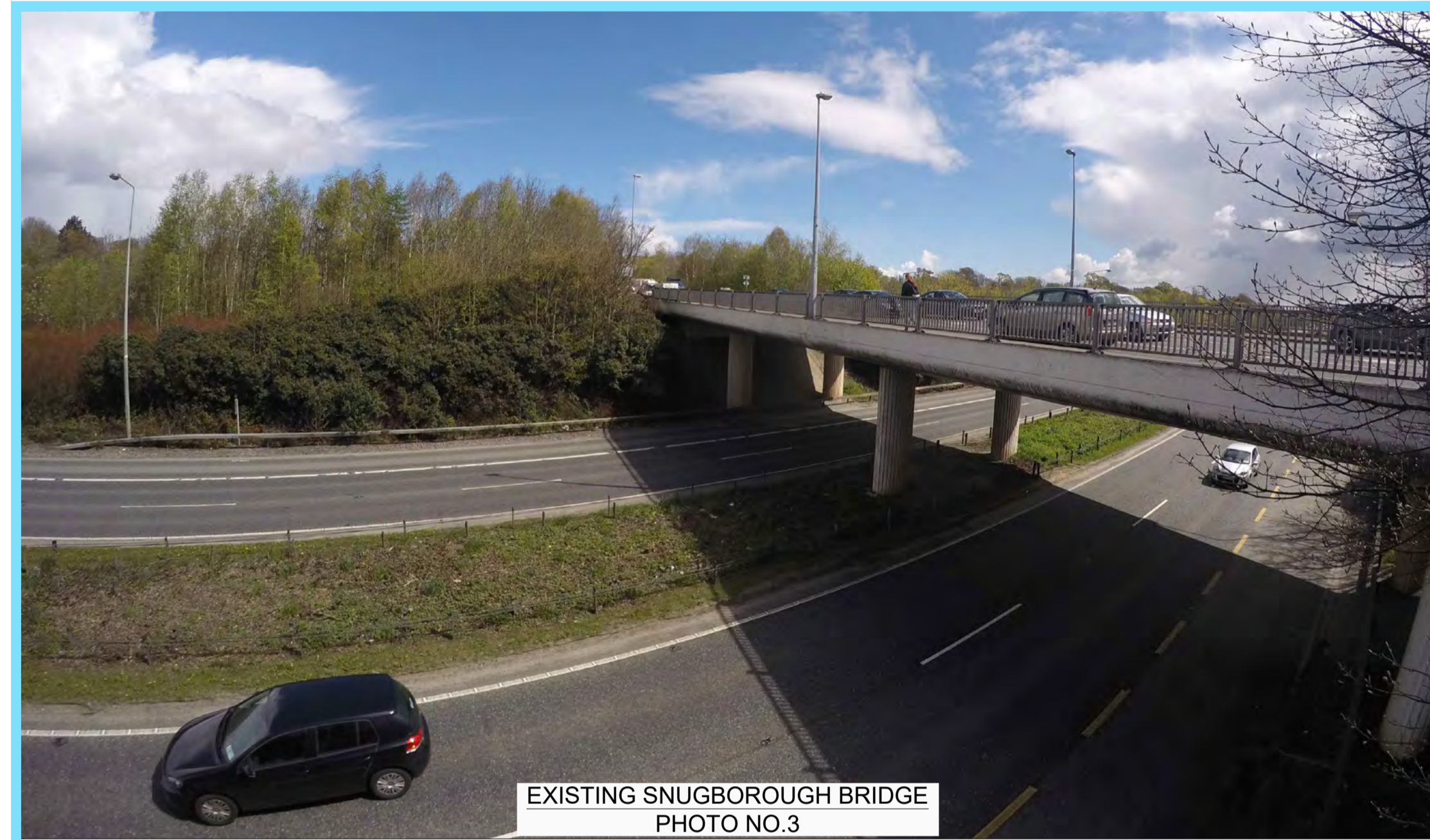
EXISTING SNUGBOROUGH BRIDGE PHOTO NO.3