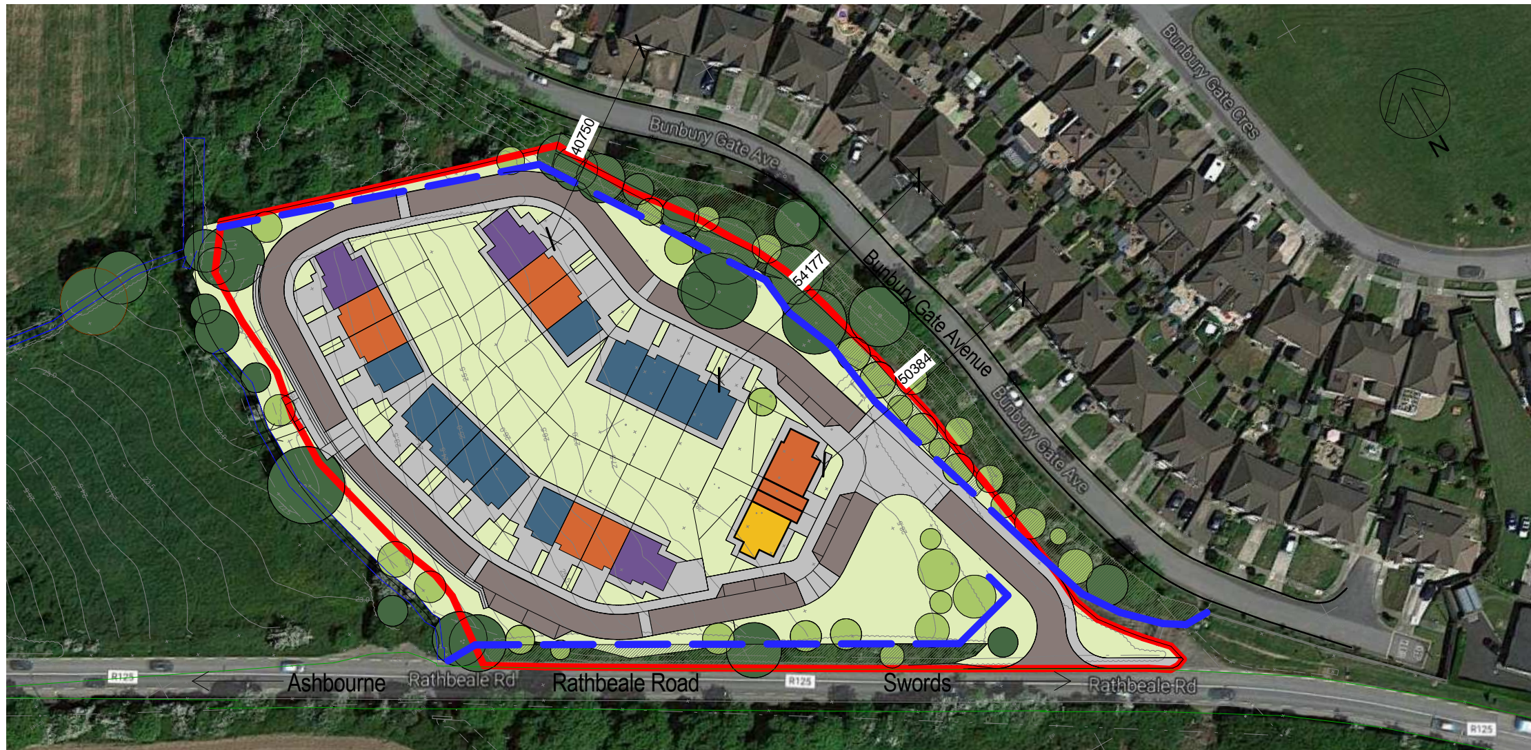
Site Plan - Context