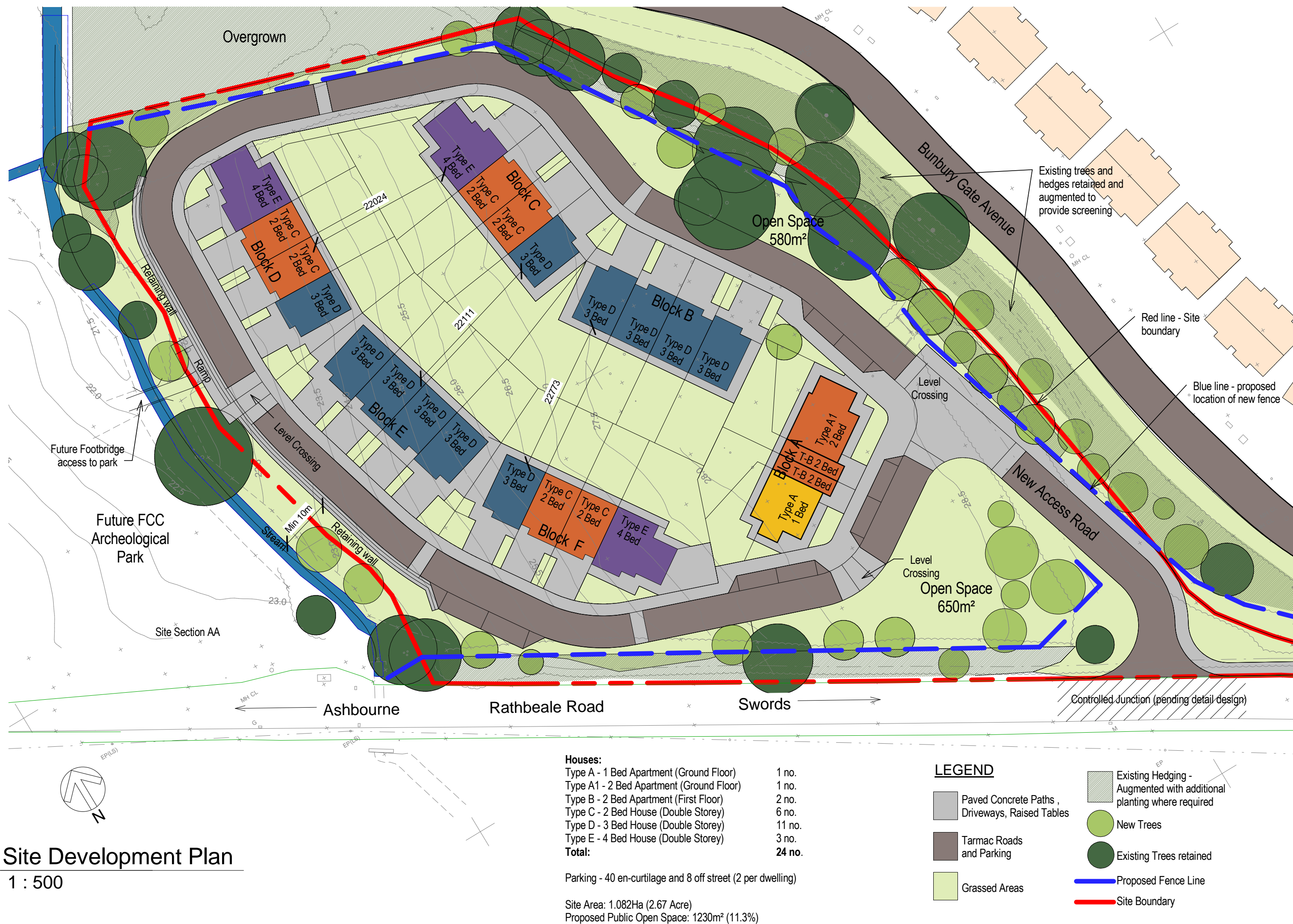
Site Development Plan

ARCHITECTS' DEPARTMENT, FINGAL COUNTY COUNCIL