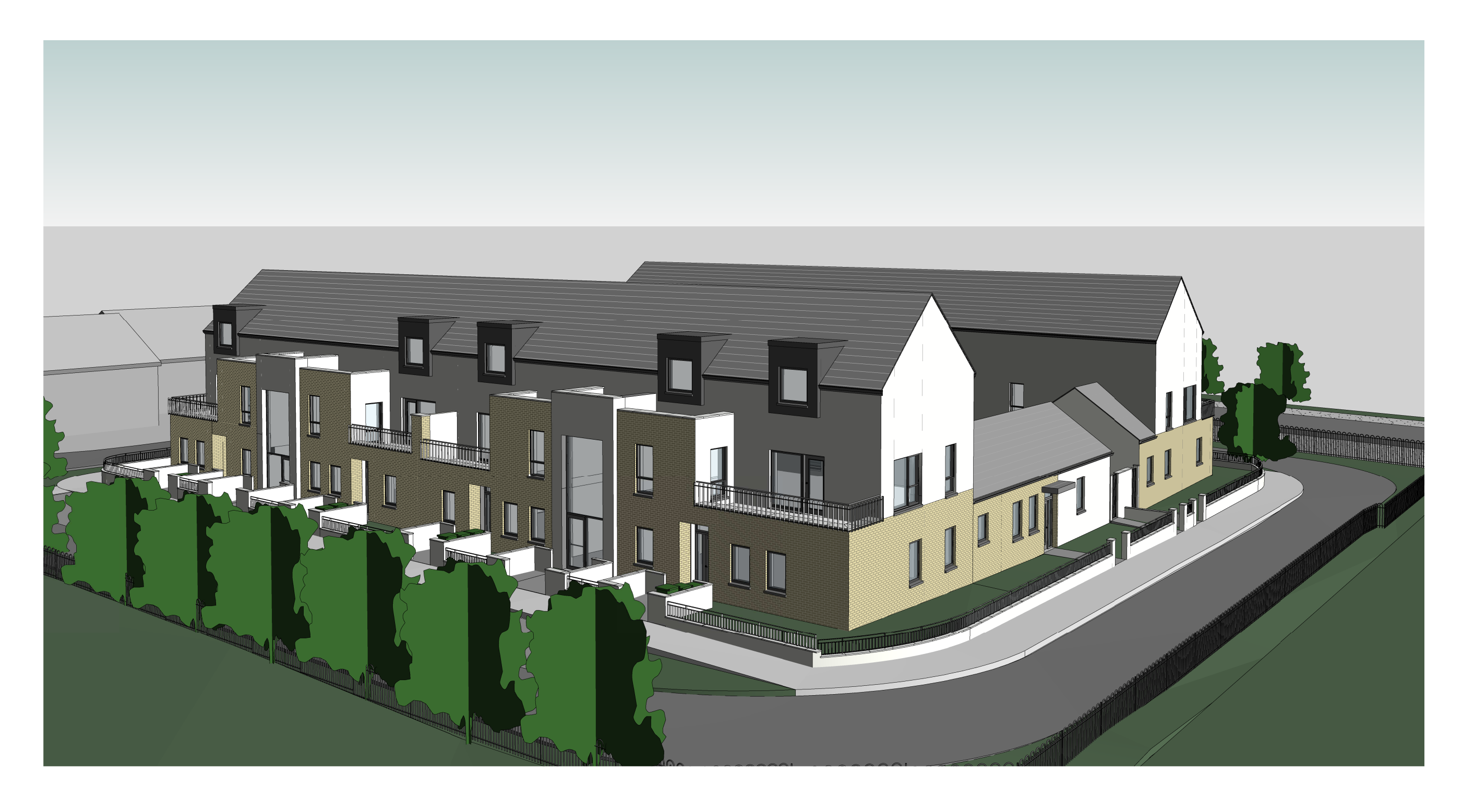
3 3D View 4