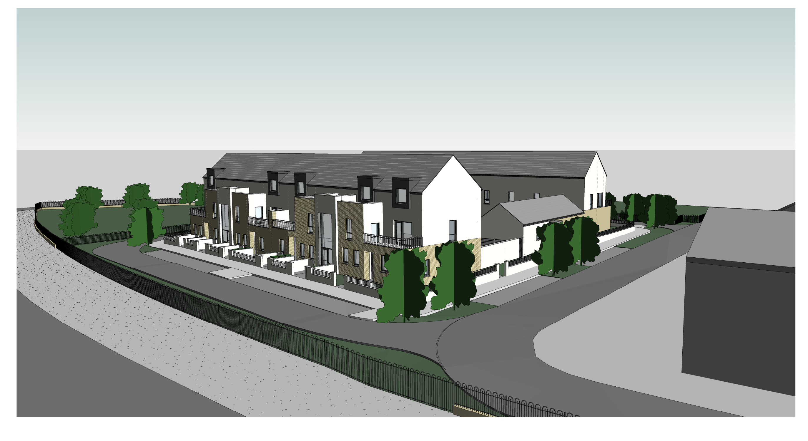
3D View 2