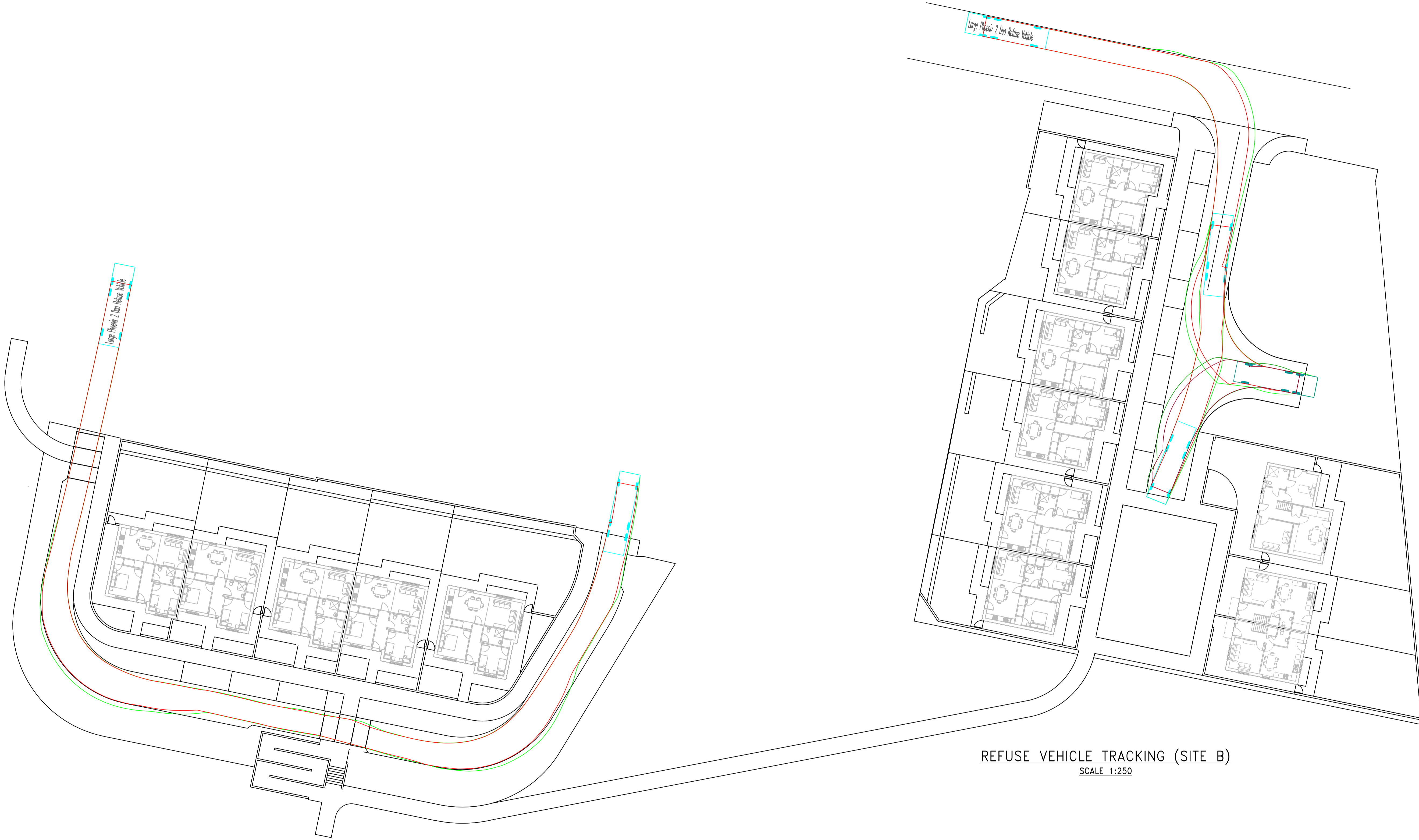
REFUSE VEHICLE TRACKING (SITE A) SCALE 1:250