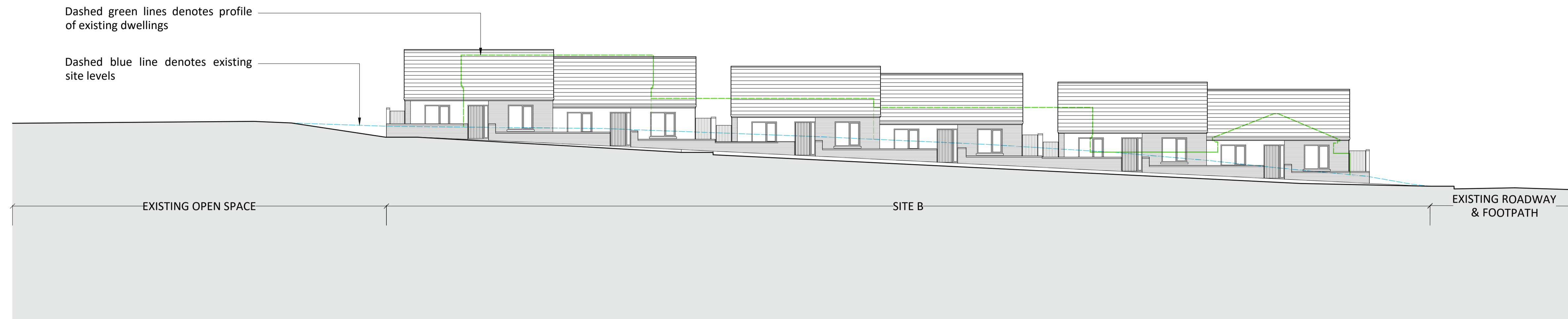
205 22-341 SITE B: SECTION X-X 1:200