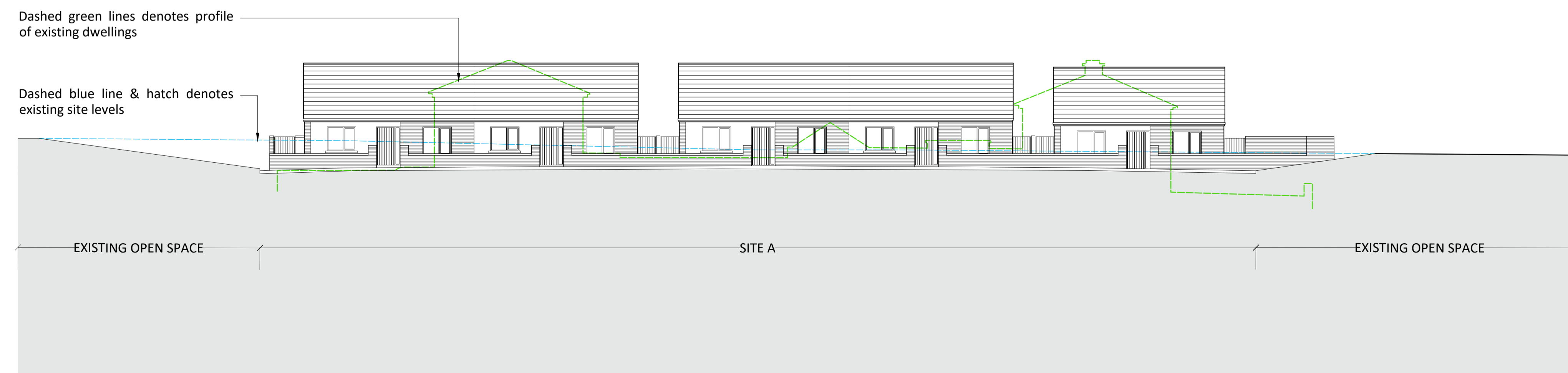
205 22-341 SITE A: SECTION Z-Z 1:200