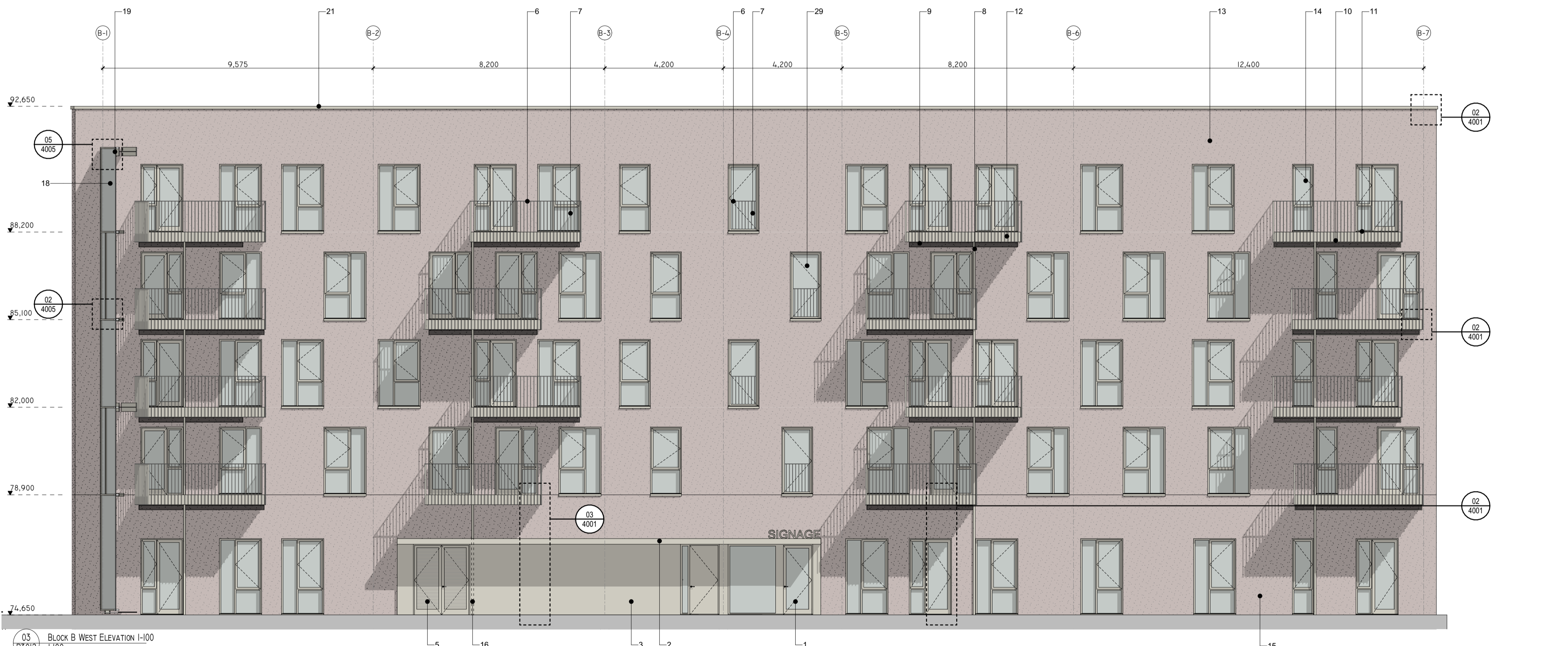
03 BLOCK B WEST ELEVATION I-100 P3012 1:100