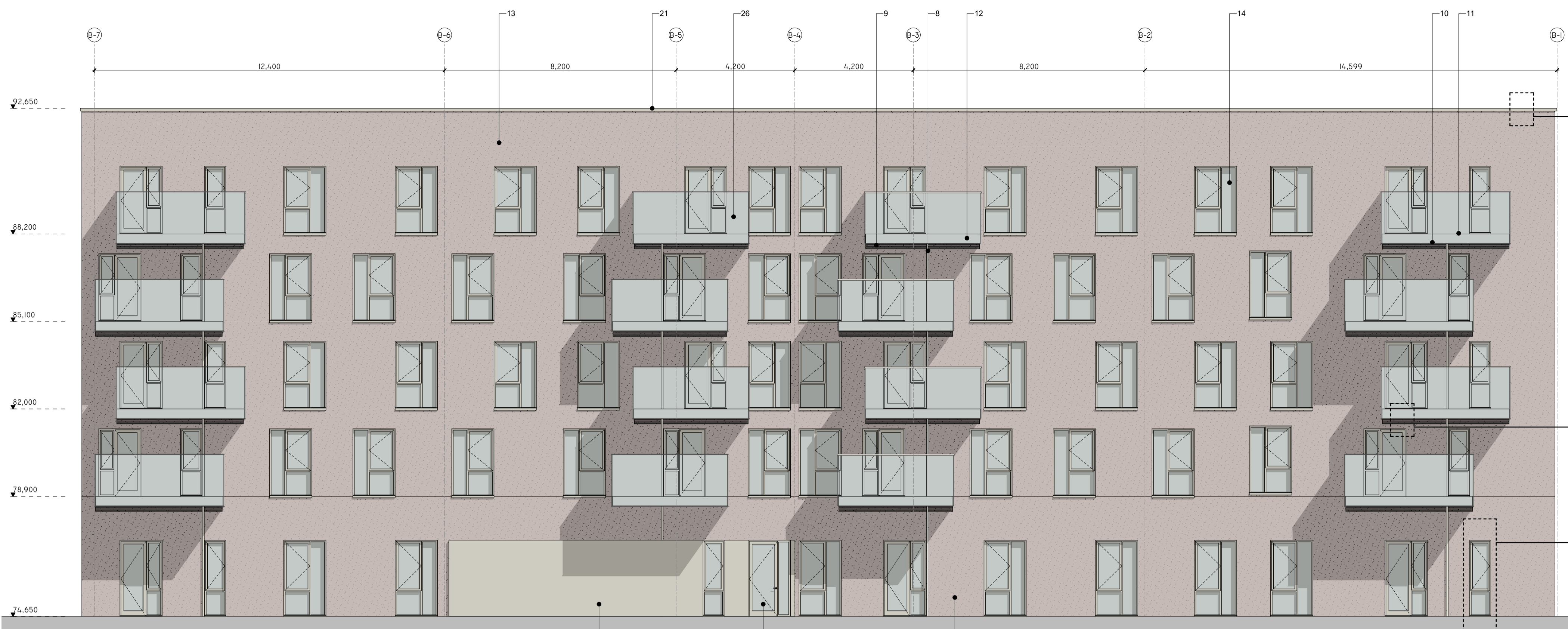
01 BLOCK B EAST ELEVATION I-100 P3012 1:100