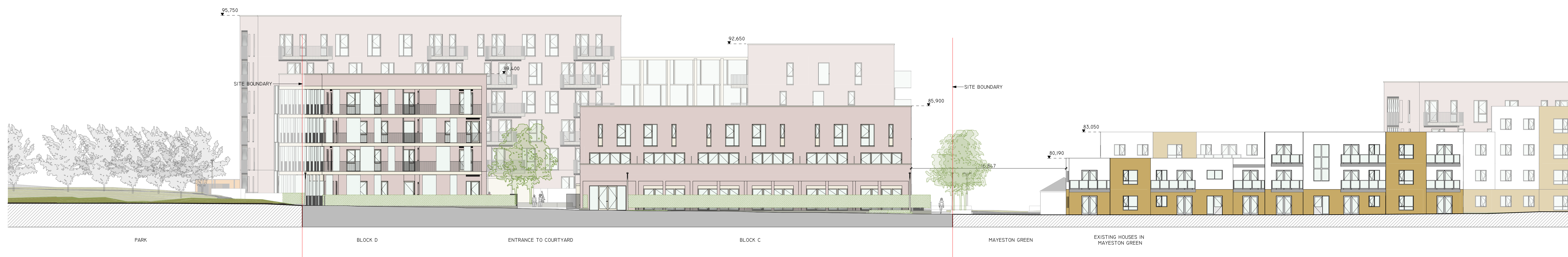
E-01 SOUTH ELEVATION P300 1:200