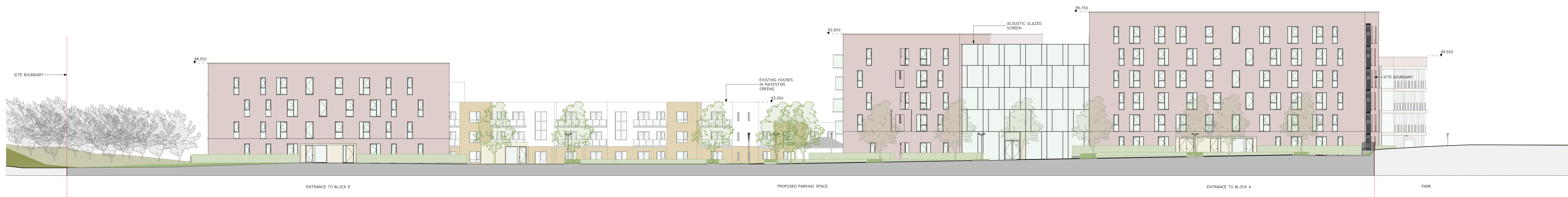
E-03 NORTH ELEVATION P300 1:200