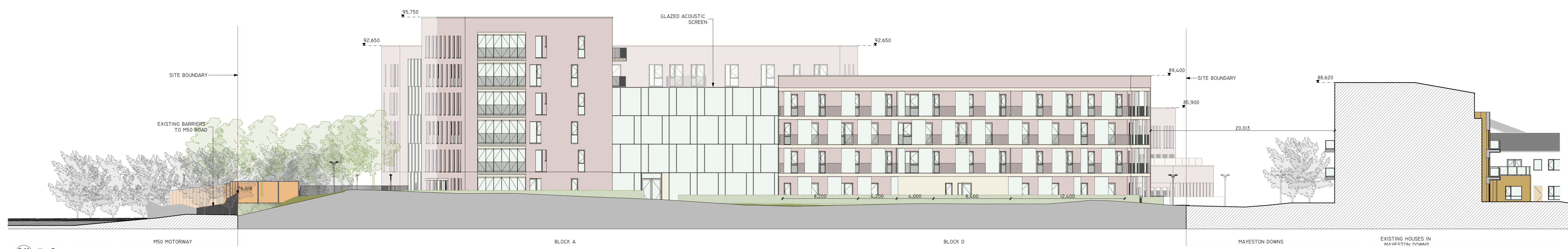
E-02 WEST ELEVATION P300 1:200