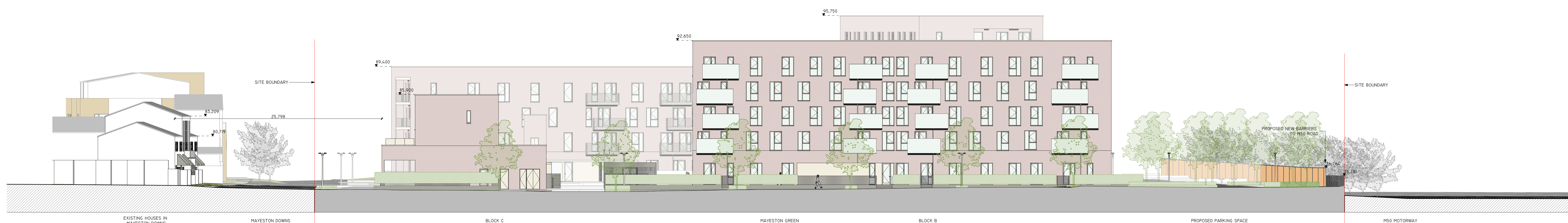
E-04 EAST ELEVATION P300 1:200