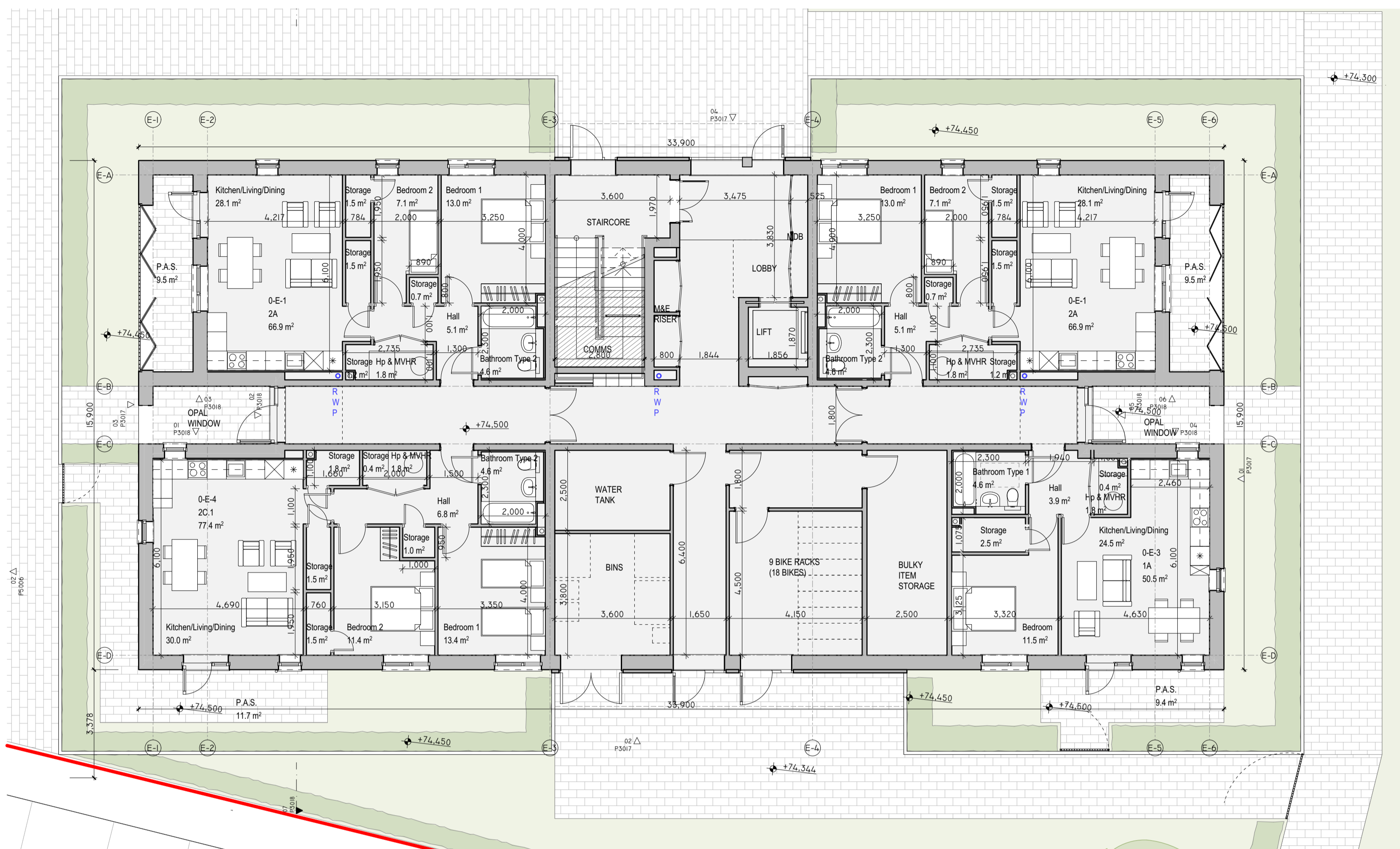
01 LEVEL 00 PI060 1:100