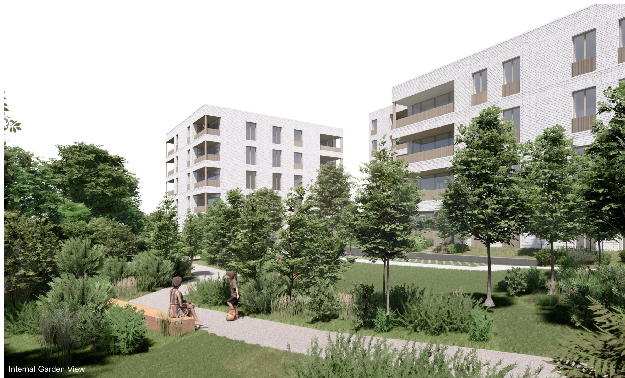
Internal Garden View