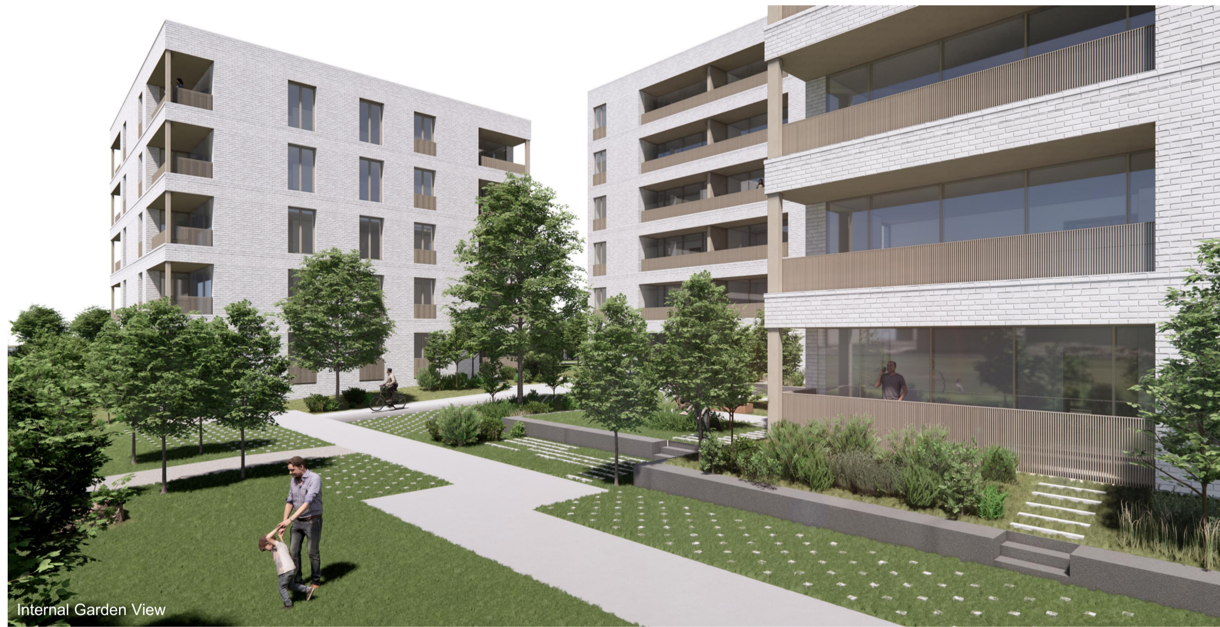
Internal Garden View