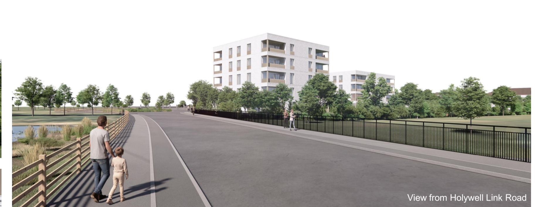
View from Holywell Link Road