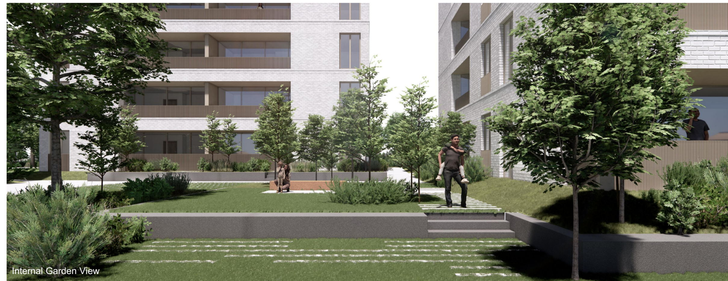
Internal Garden View