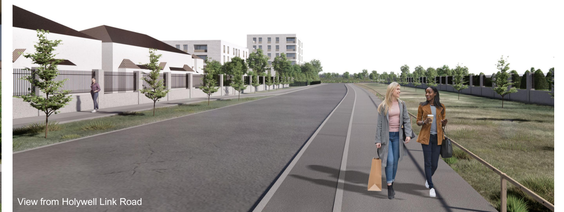
View from Holywell Link Road

GENERAL NOTES ±0.00 = FINISHED GROUND FLOOR LEVEL = OS +26.4 TO BE READ IN CONJUNCTION WITH ALL TENDER INFORMATION FROM ALL OTHER DESIGN CONSULTANTS. NOTIFY ARCHITECT OF ANY DISCREPANCIES. CHECK DIMENSIONS ON SITE. DO NOT SCALE. USE FIGURED DIMENSIONS ONLY. COPYRIGHT RESERVED. SIX DIGIT CODE IN EACH PRODUCT DESCRIPTION REFERS TO THE RELEVANT SECTION IN THE HRA SPEC.