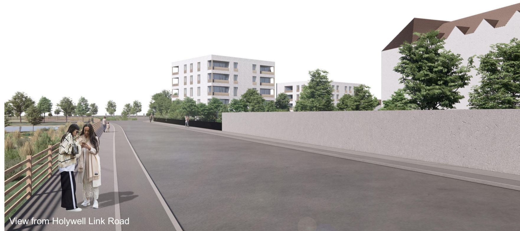
View from Holywell Link Road