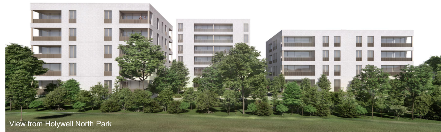
View from Holywell North Park