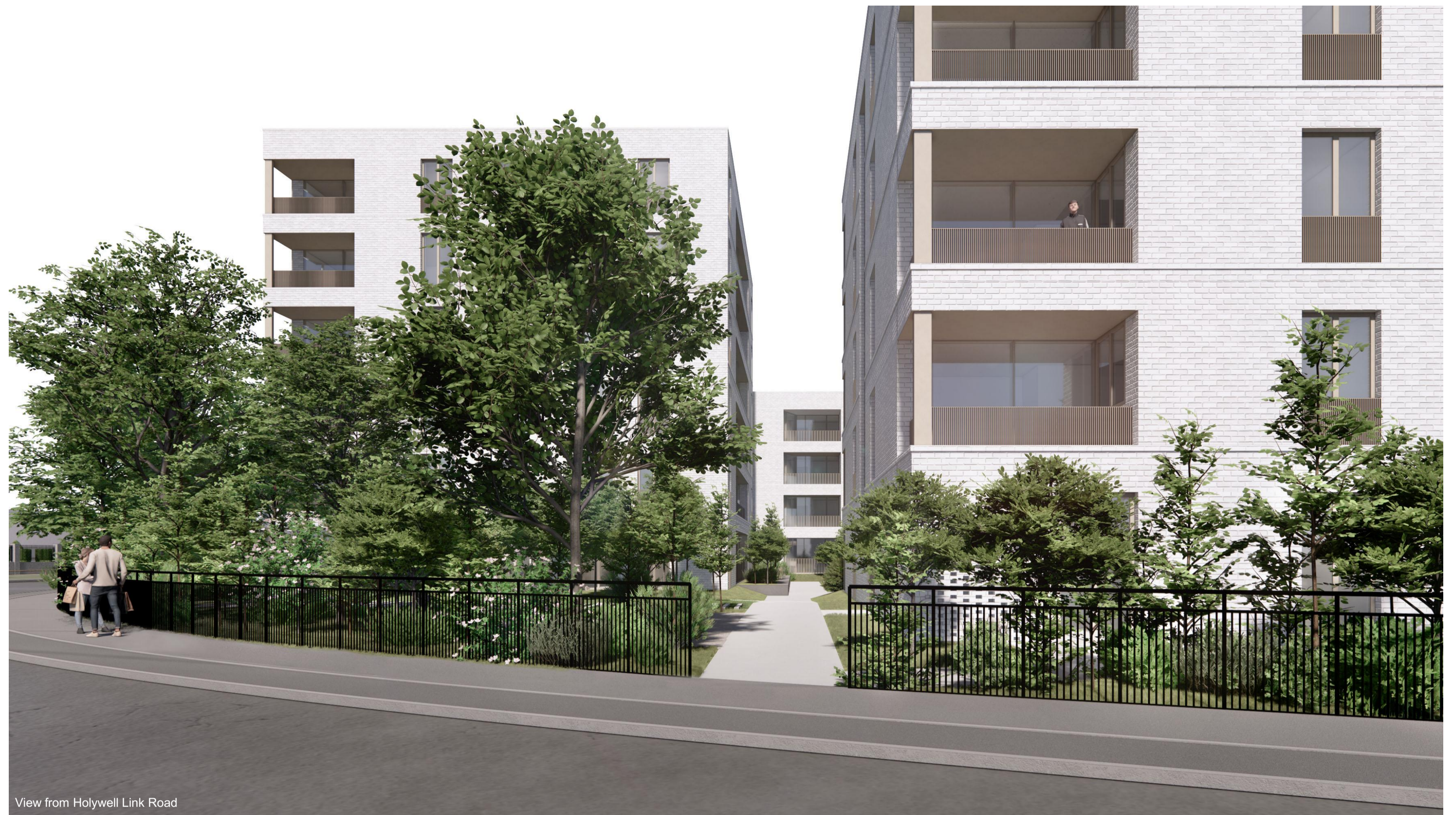
View from Holywell Link Road