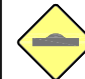
Road Signage Not to Scale

ROAD TRAFFIC ACTS 1993 - 2015 PUBLIC TRANSPORT REGULATION ACT, 2009 TRAFFIC CALMING SCHEMES