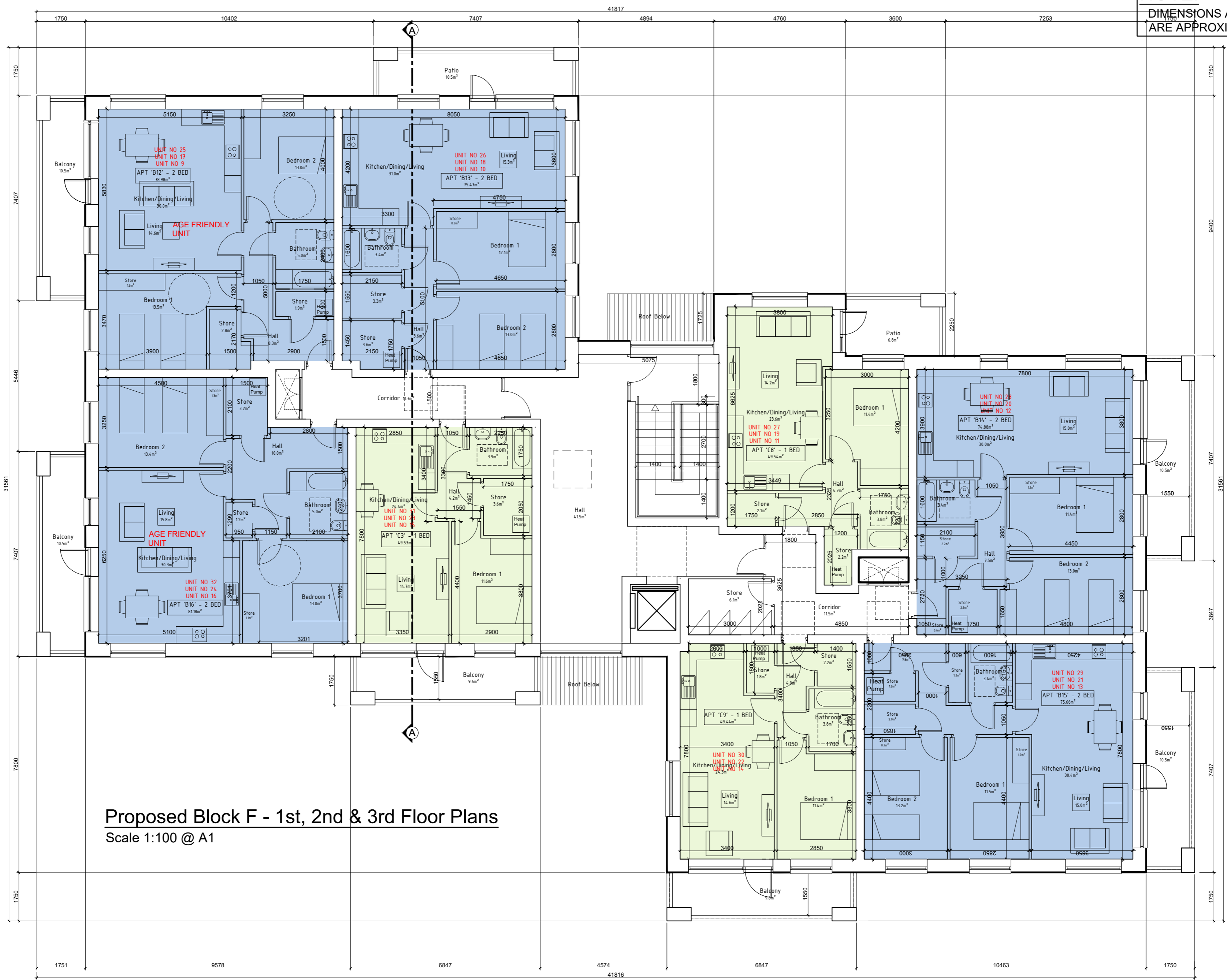
Proposed Block F - 1st, 2nd & 3rd Floor Plans Scale 1:100 @ A1

NOTE: DIMENSIONS AND LEVELS SHOWN ARE APPROXIMATE ONLY