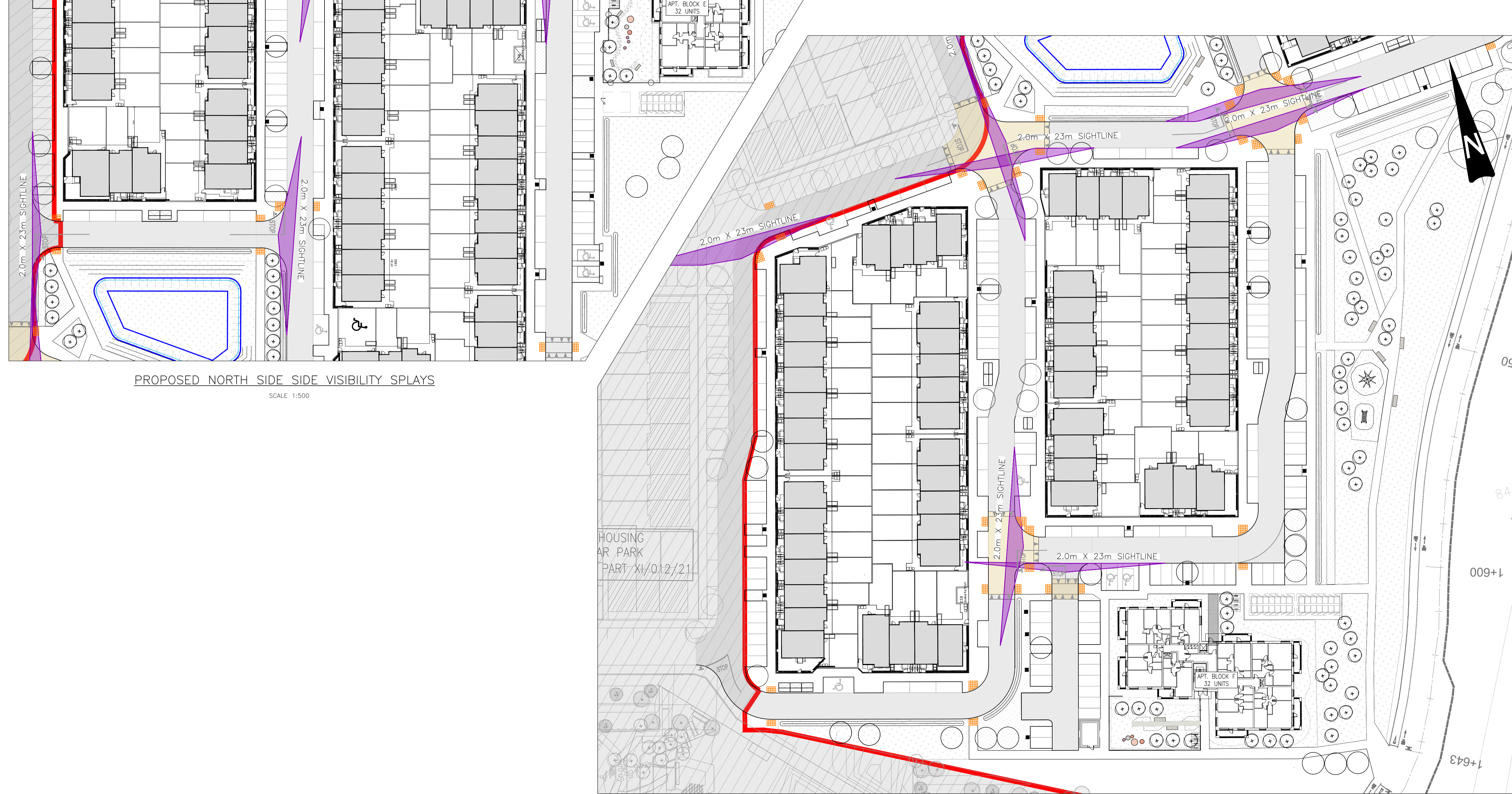
PROPOSED NORTH SIDE SIDE VISIBILITY SPLAYS SCALE 1:500