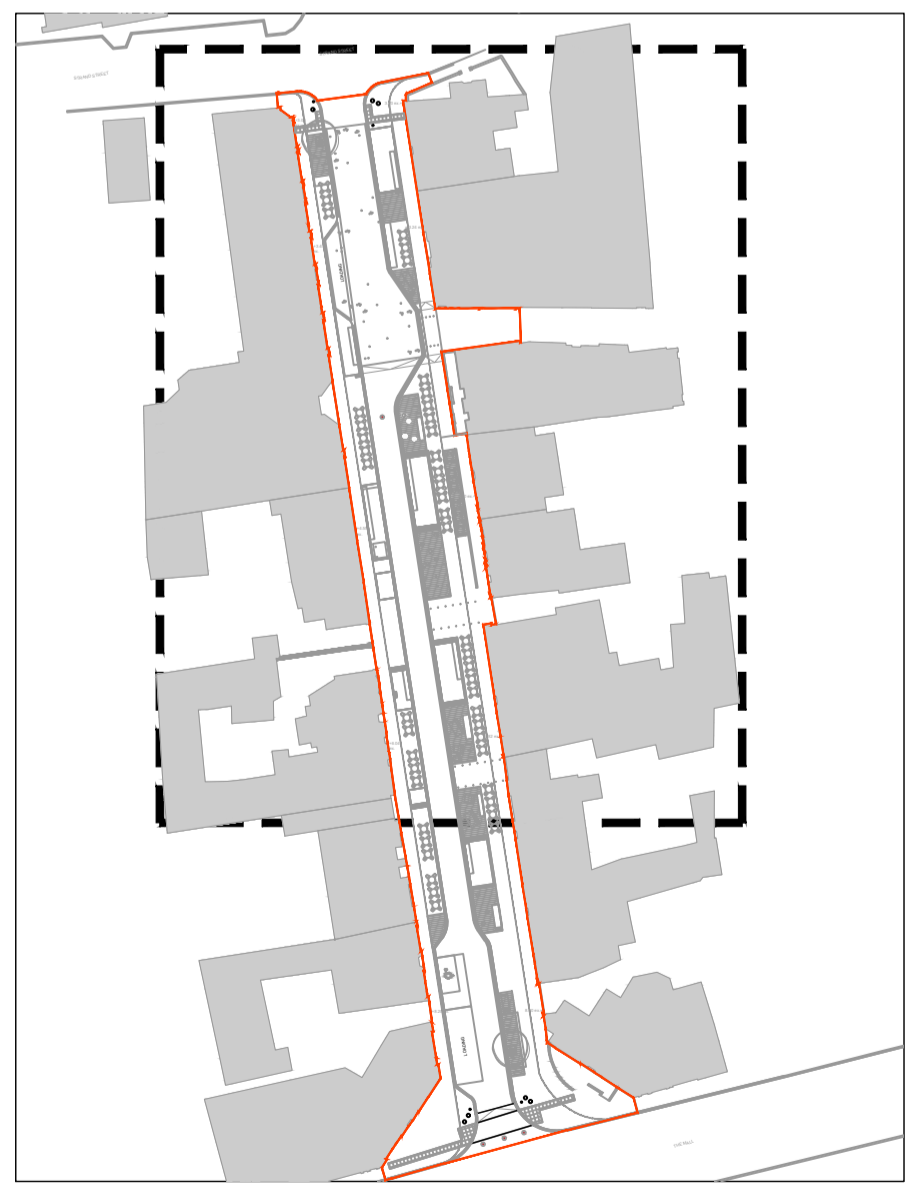
KEY PLAN NOT TO SCALE

Ordnance Survey Ireland Licence No. CYALS0313286 © Ordnance Survey Ireland/Government of Ireland