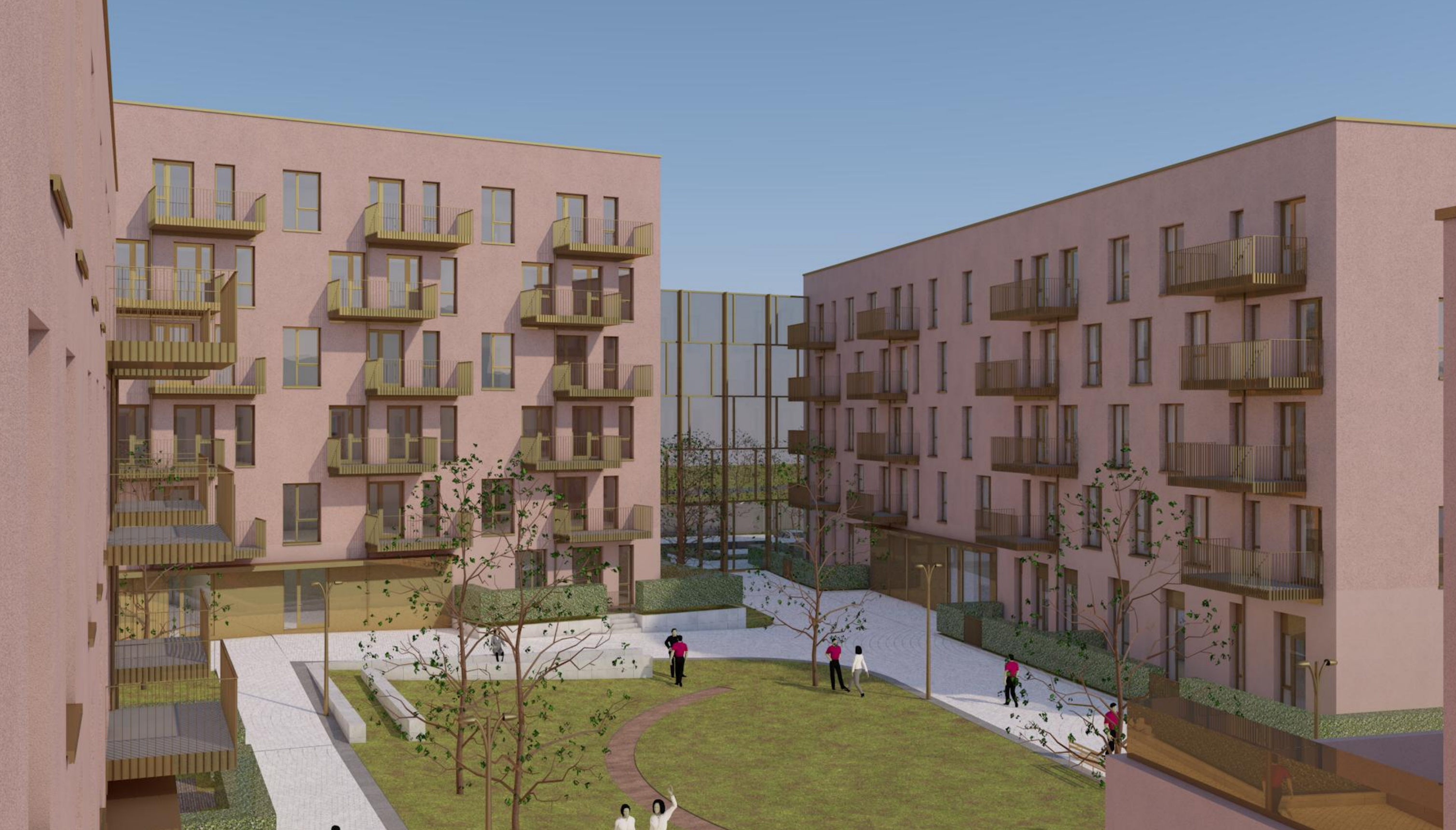
VIEW OF COURTYARD SPACE P900 I:1.67