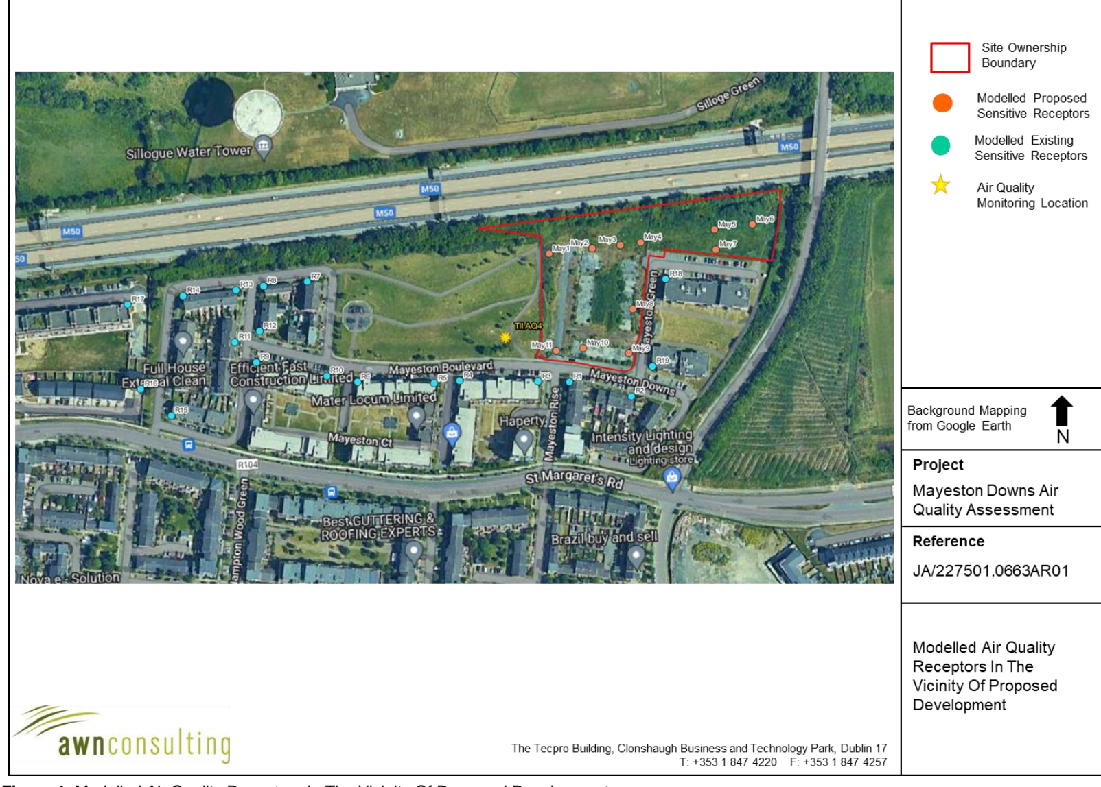
Figure 1. Modelled Air Quality Receptors In The Vicinity Of Proposed Development