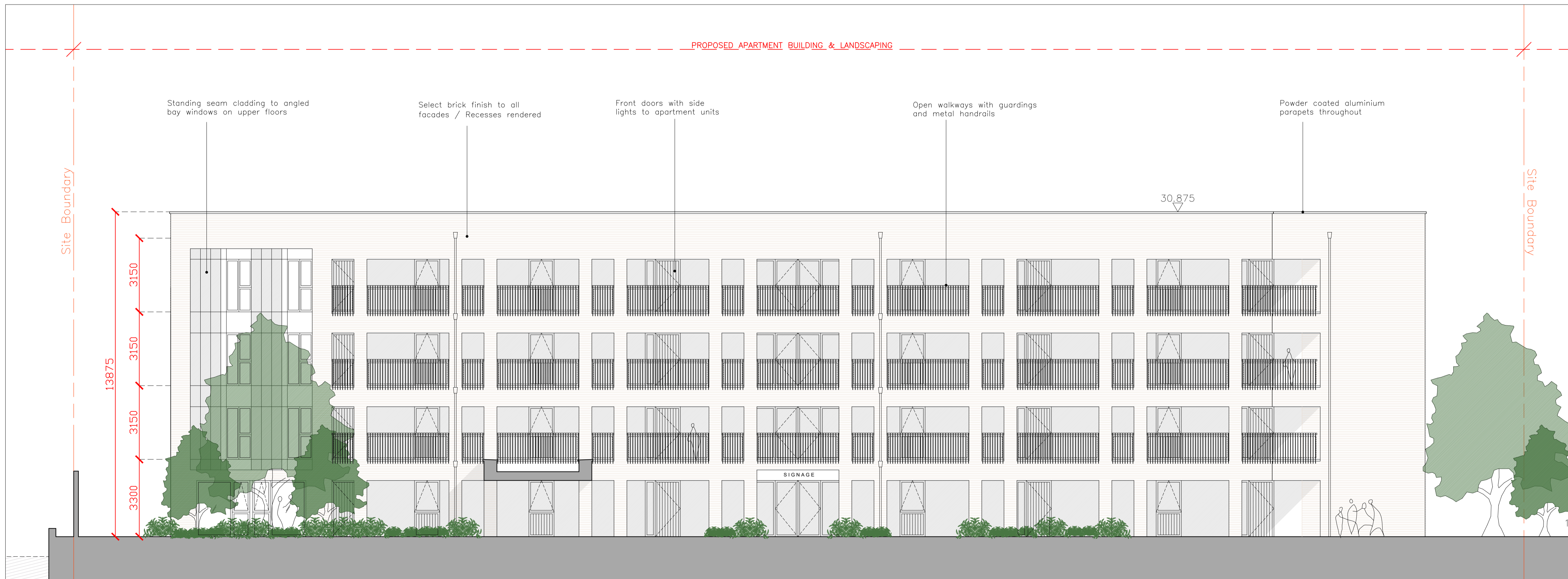
SITE NO 2 - PROPOSED SECTIONAL ELEVATION S2B (SOUTH EAST) / SCALE 1:100