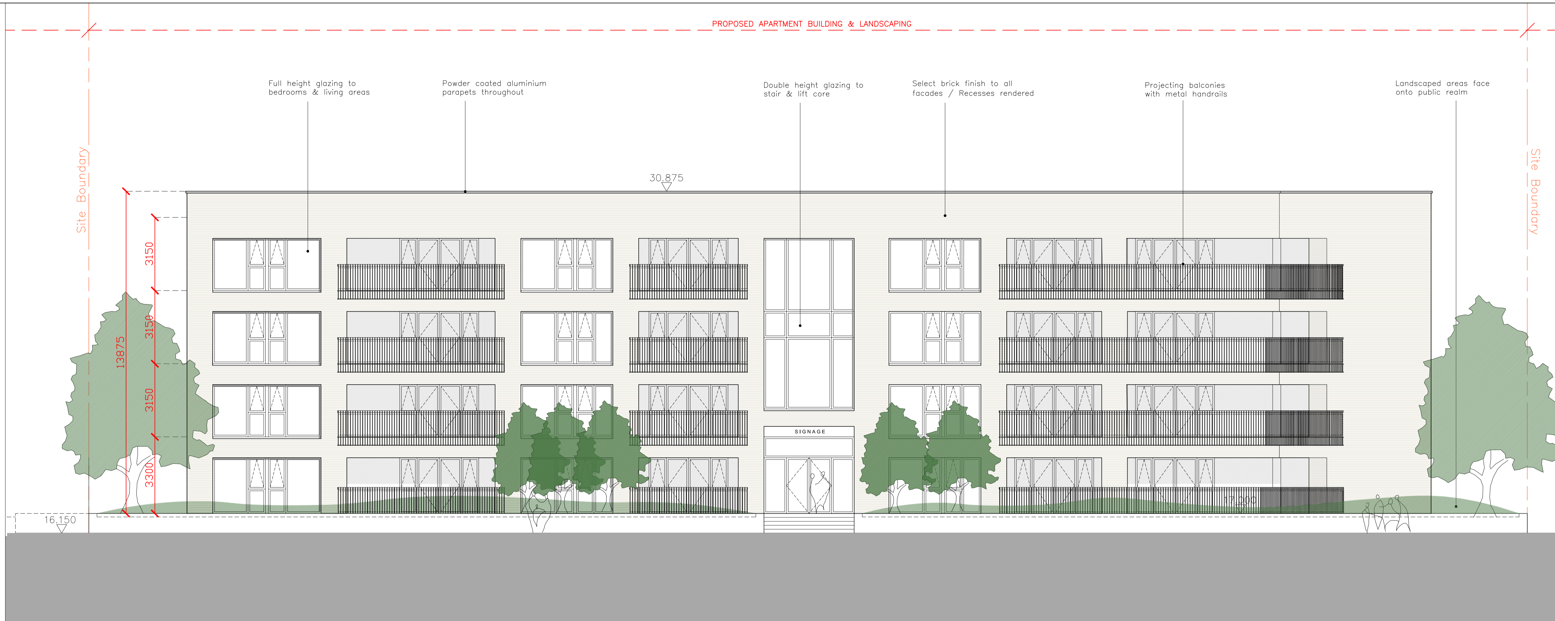
SITE NO 2 - PROPOSED SECTIONAL ELEVATION S2A (NORTH WEST) / SCALE 1:100