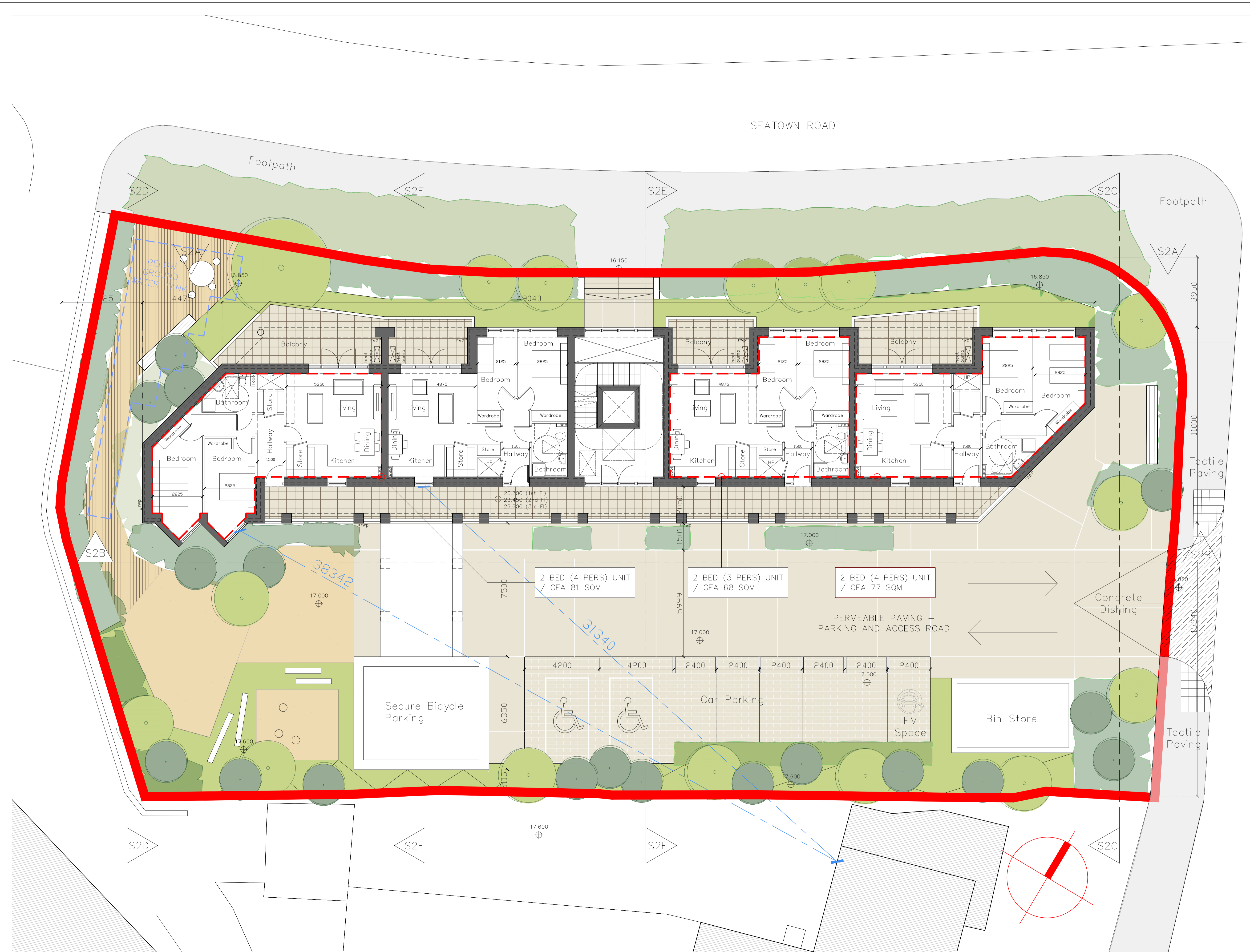
SITE NO 2 - PROPOSED FIRST / SECOND / THIRD FLOOR PLANS (SCALE 1:100)