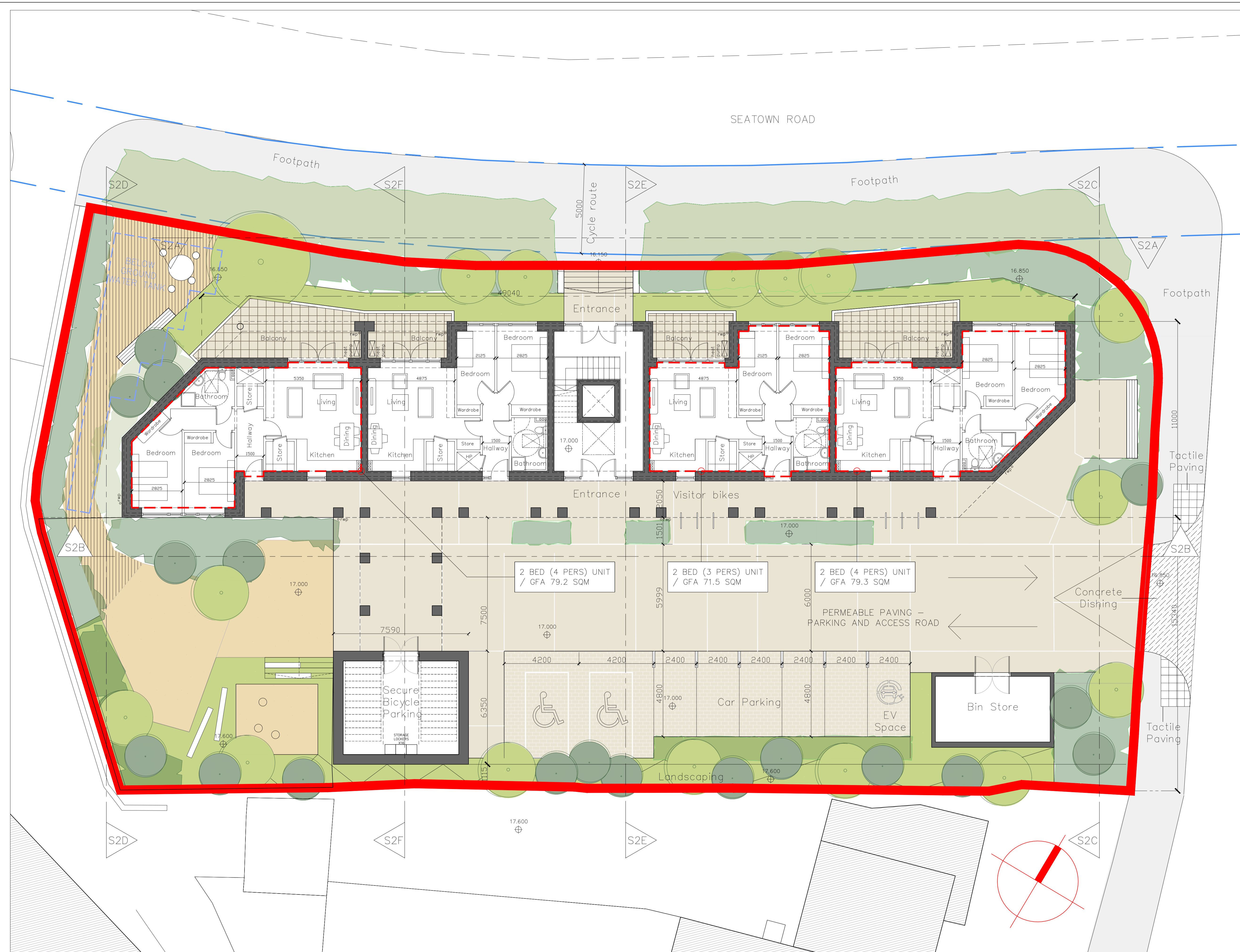
SITE NO 2 - PROPOSED GROUND FLOOR PLAN (SCALE 1:100)