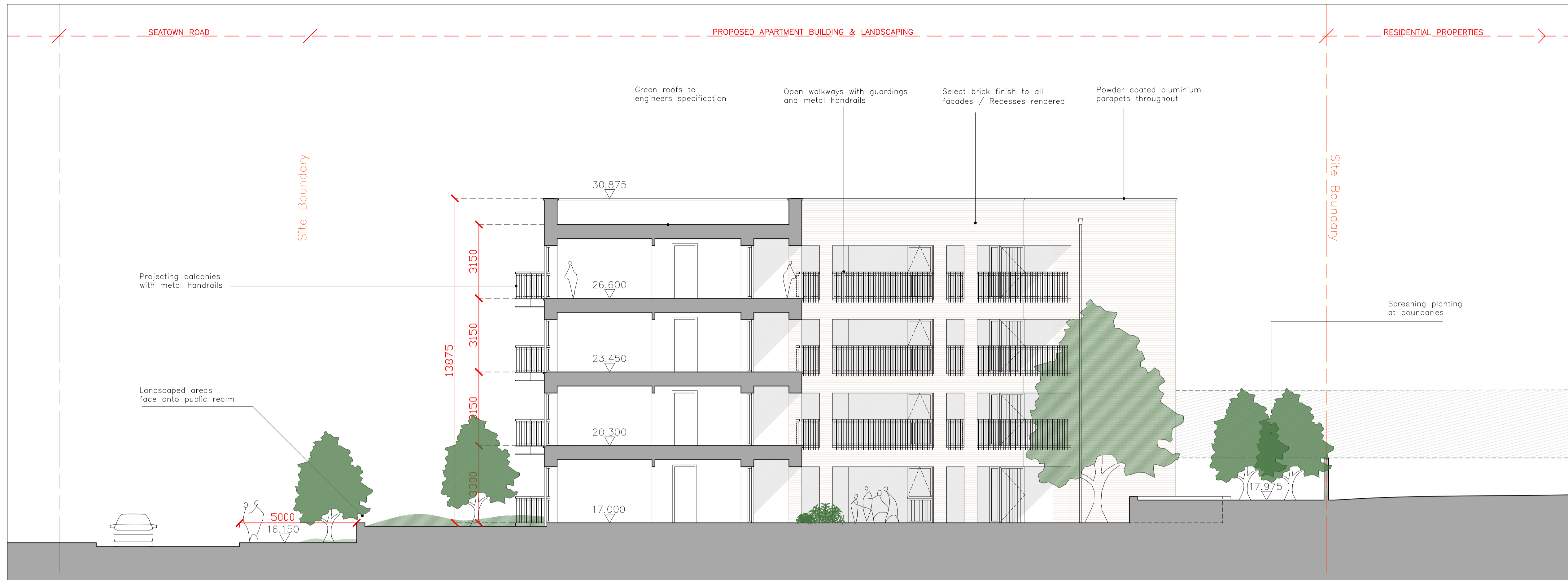
SITE NO 1 - PROPOSED SECTIONAL ELEVATION S1E (WEST) / SCALE 1:100