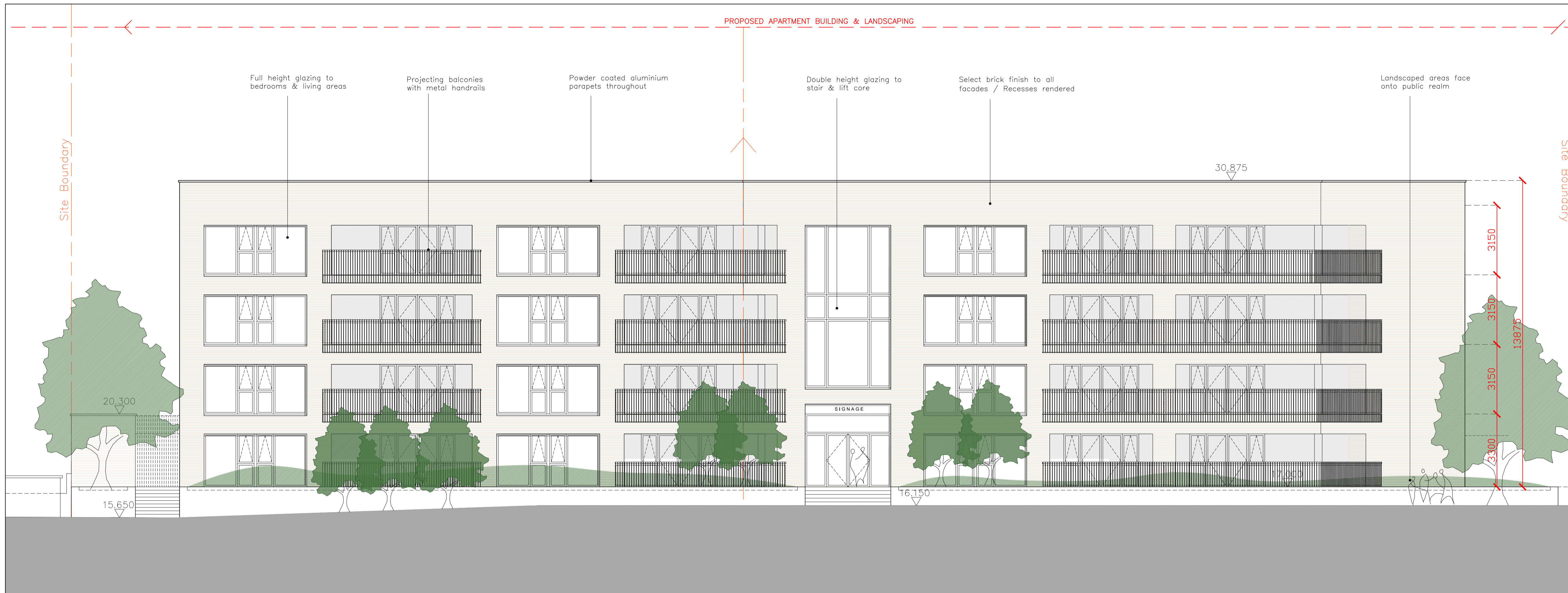
SITE NO 1 - PROPOSED SECTIONAL ELEVATION S1A (NORTH WEST) / SCALE 1:100