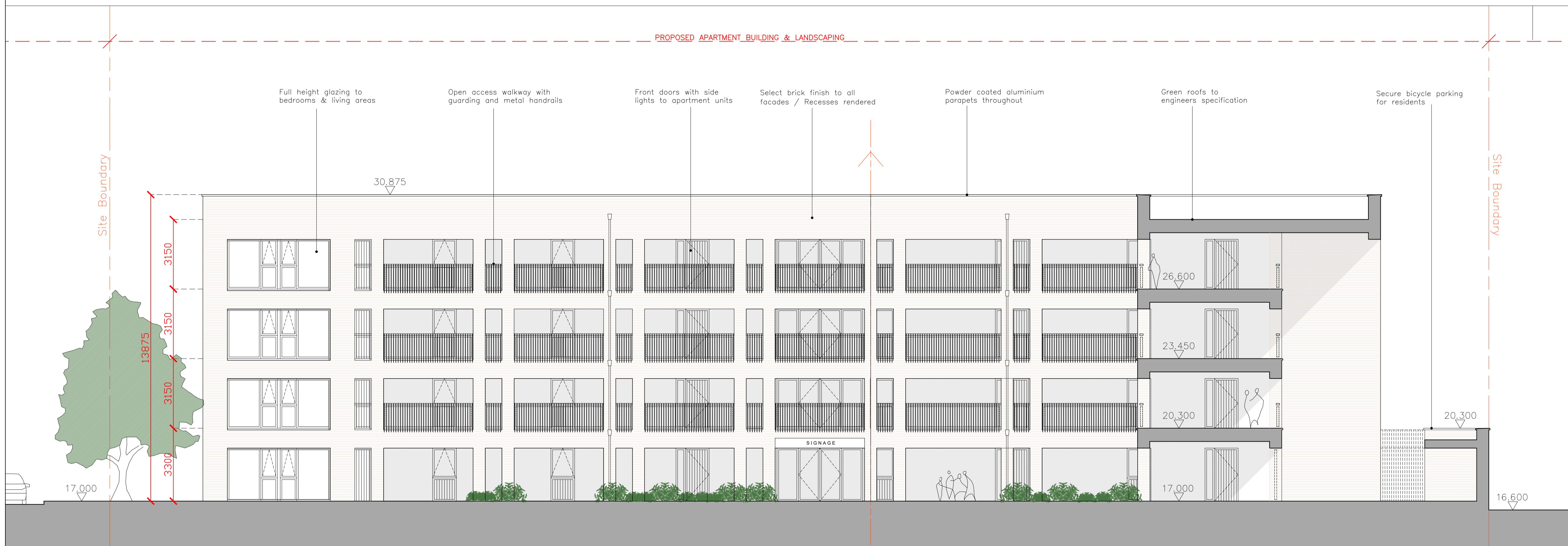
SITE NO 1 - PROPOSED SECTIONAL ELEVATION S1B (SOUTH EAST) / SCALE 1:100