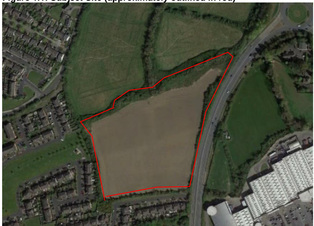
Figure 1.1: Subject Site (approximately outlined in red)

A Strategic Housing Development application (ABP Ref.: 313331-22) was submitted to An Bord Pleanála on the 14<sup>th</sup> April 2022 for the subject lands and is currently awaiting a decision from the Board (i.e. the statutory timeframe of 16 weeks was not met). The proposed development comprises a Strategic Housing Development of 645 no. residential units, in 10 no. apartment buildings, with heights ranging from 4 no. storeys to 10 no. storeys, including undercroft / basement levels (for 6 no. of the buildings). The proposals include 1 no. community facility in Block 1, 1 no. childcare facility in Block 3, and 5 no. commercial units in Blocks 4 and 8.