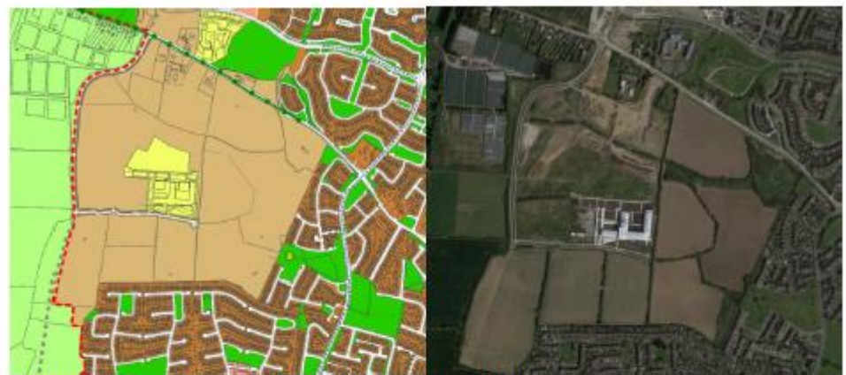
Figures 3.4 Residential lands at Moorestown, Swords

An excerpt from the MKN submission is included below for ease of reference: