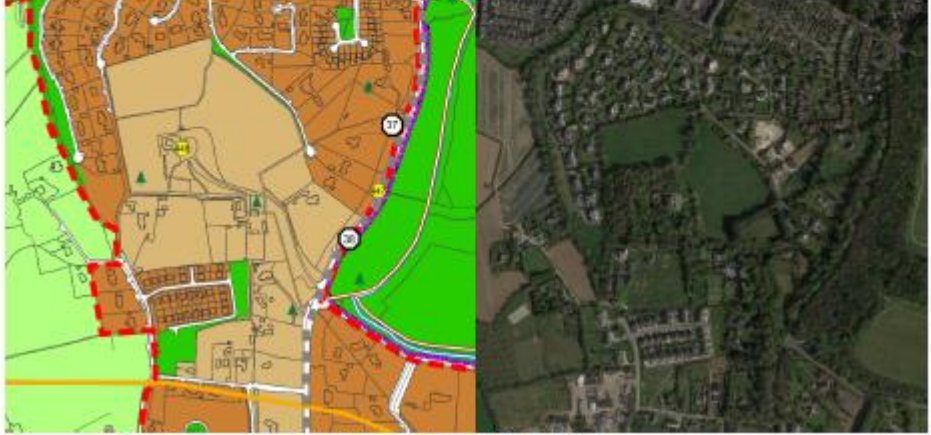
Figures 3.5 RA zoned lands at Mabestown, Malahide,

Furthermore, while masterplans were prepared for other areas of Swords, which include similar density ranges to the range included in the Fosterstown masterplan, there are no similar objectives inserted with respect to those lands in the Draft Plan. For example, the