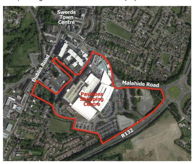
Figure 2: Aerial Photograph of Swords Pavilions with lands outlined in red

Hammerson ICAV co-own the lands that currently accommodate the existing and operational Swords Pavilions (Phases 1 & 2), including the shopping centre and associated car parking areas (both permanent and temporary). Hammerson is the sole owner of the Pavilions undeveloped lands (also known as the '5 acres') fronting the R132 and the Dublin Road properties.