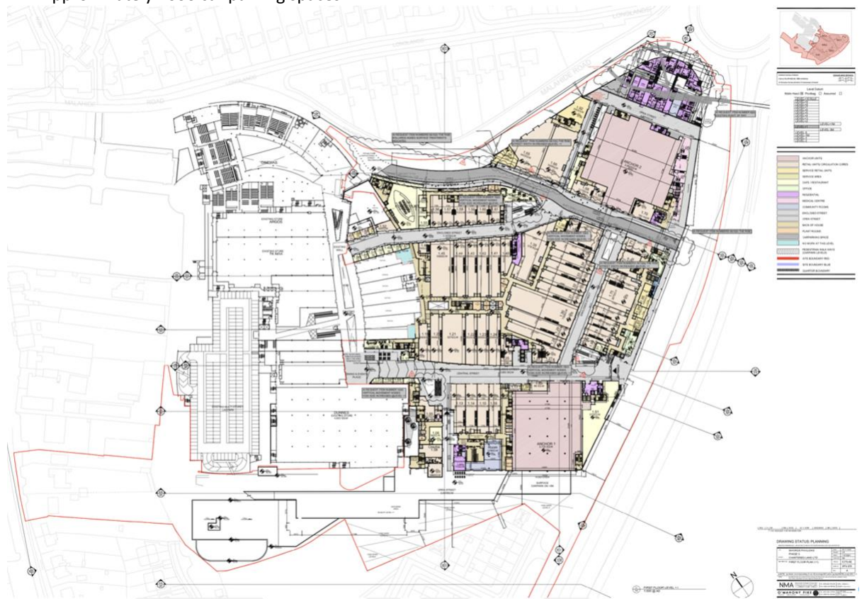
Figure 3: Site Plan Pavilions Phase 3 Development (FCC Reg Ref F08A/1057, ABP Ref PL06F.232710)

The vehicular access to the previously permitted Phase 3 development sought the replacement of 3no. existing vehicular entrances with 1no. temporary construction entrance in place of the existing emergency entrance at the R132 and 3no. new permanent vehicular entrances and associated access roads for use during construction and operational phases. The permanent vehicular entrances included left in/left-out vehicular access off the R132, access at Malahide Road and a new vehicular access off the Dublin Road.