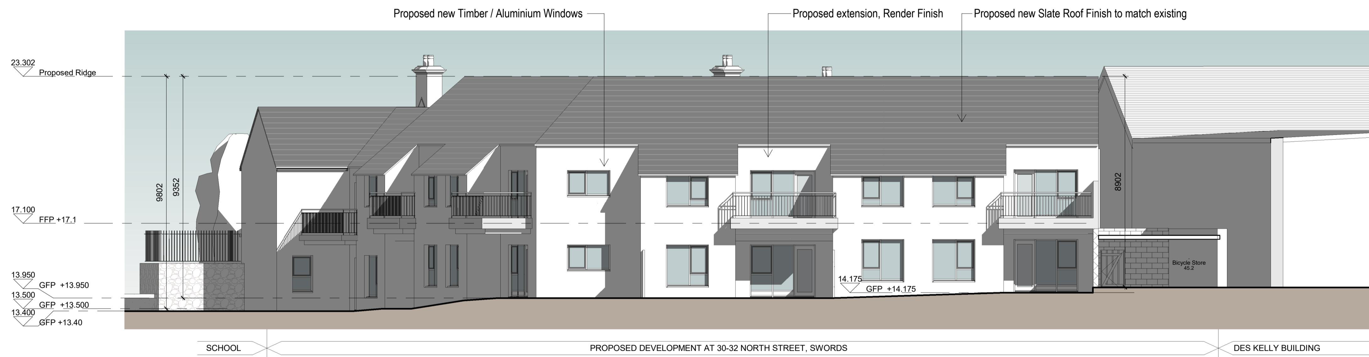
Proposed Rear (East) Elevation 1 : 100