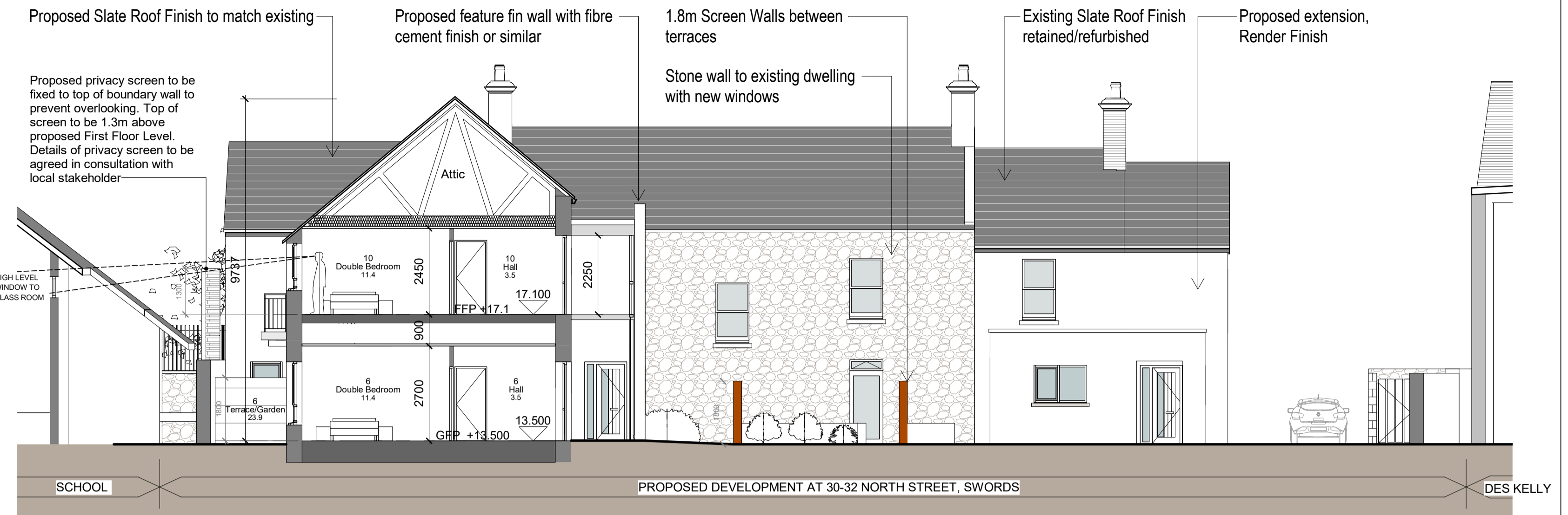
Site Section BB 1 : 100