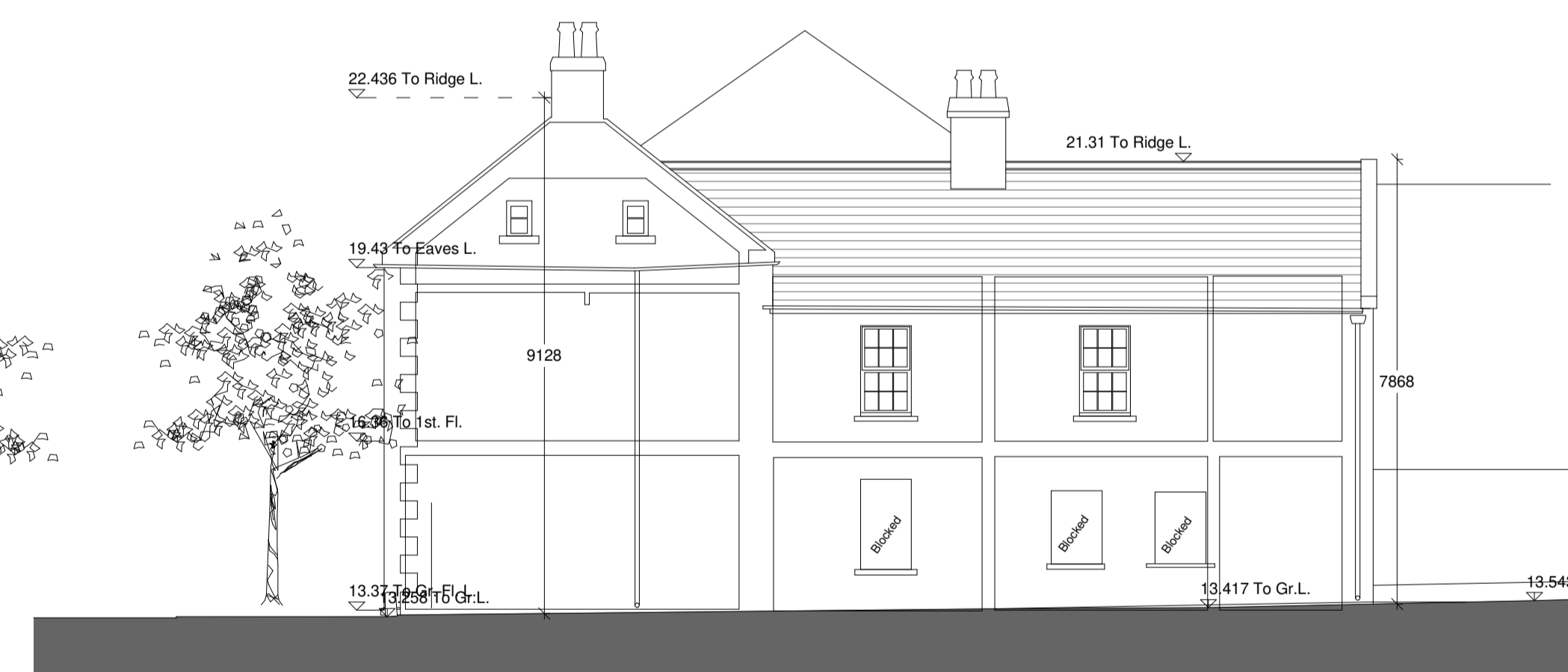
EXISTING SIDE (SOUTH) ELEVATION