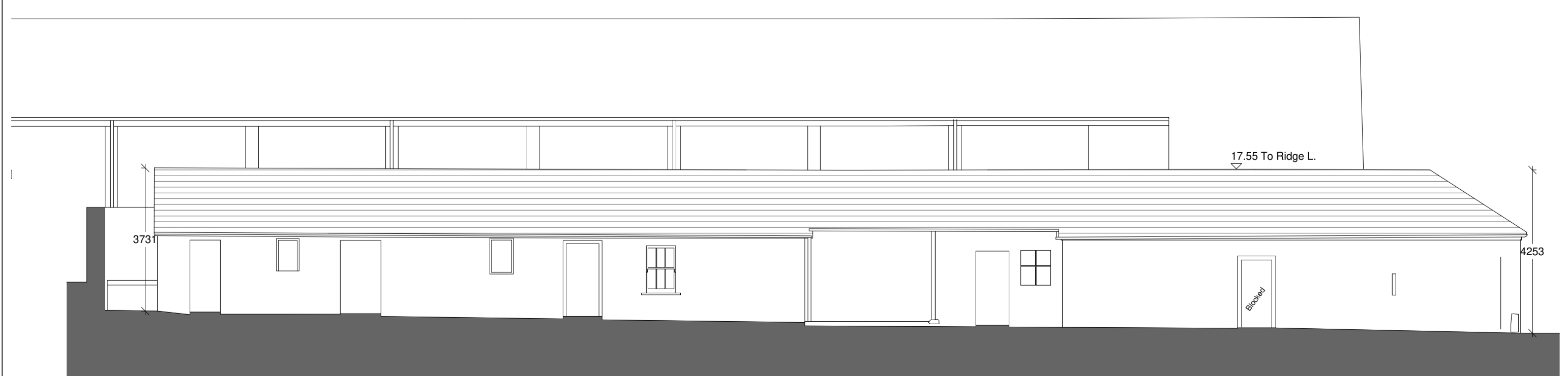
EXISTING SHED ELEVATION