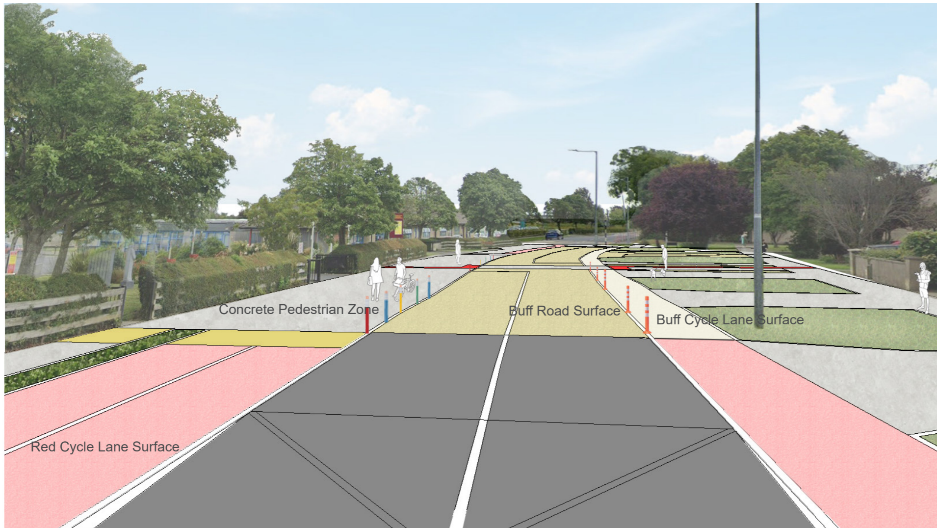
View 1 Proposal