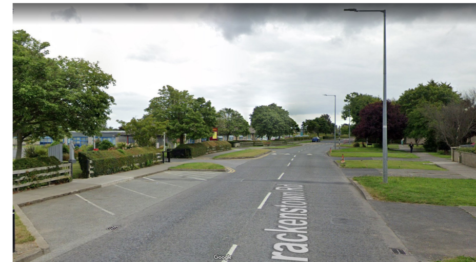
View 1 - Existing Condition