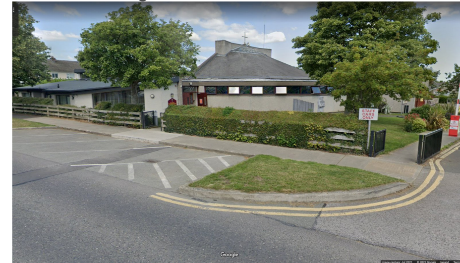
View 2 - Existing Condition