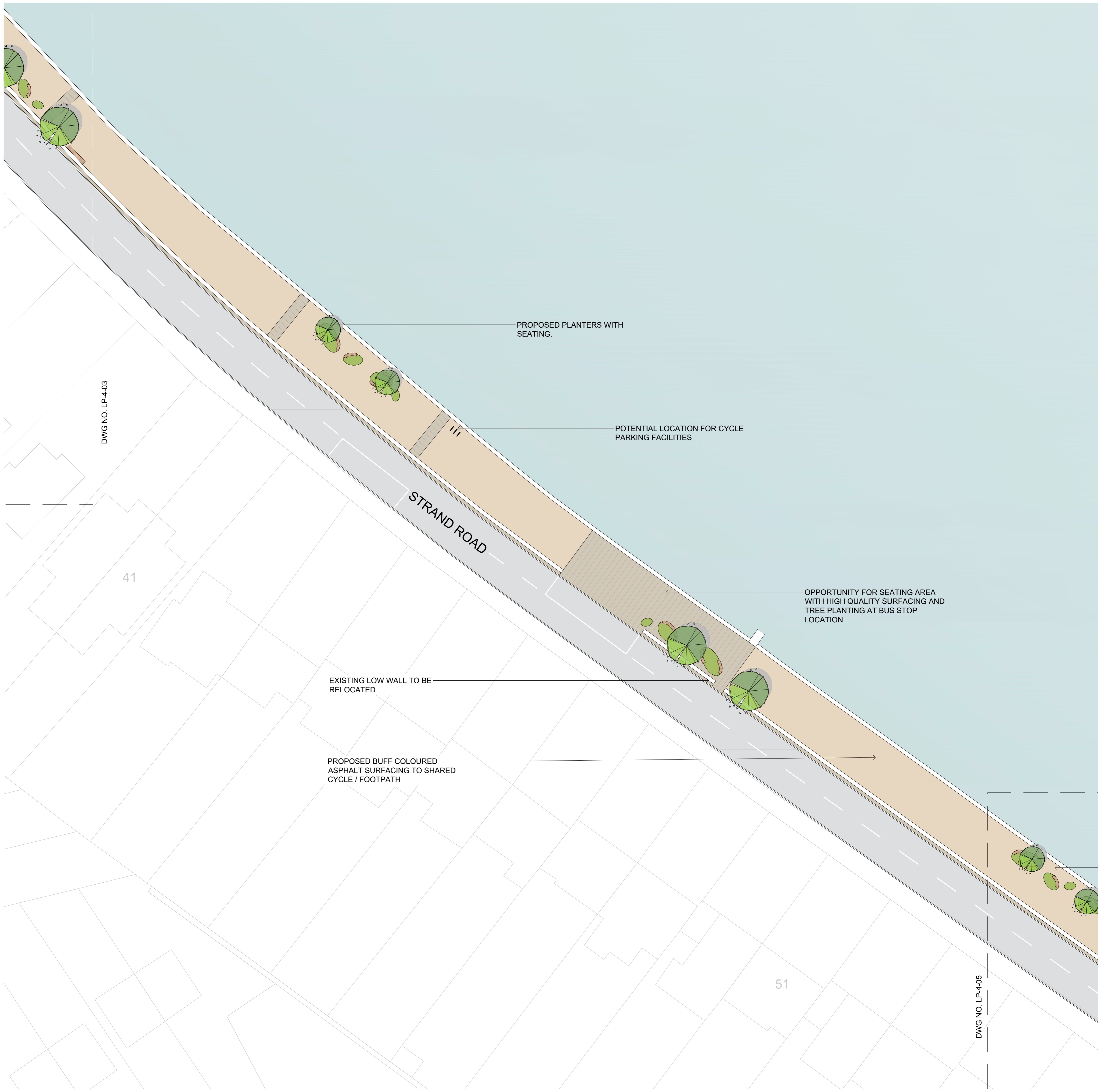
ILLUSTRATIVE EXAMPLES OF PROPOSED PUBLIC REALM ELEMENTS: SURFACING, SEATING, PLANTERS AND WALL FINISH