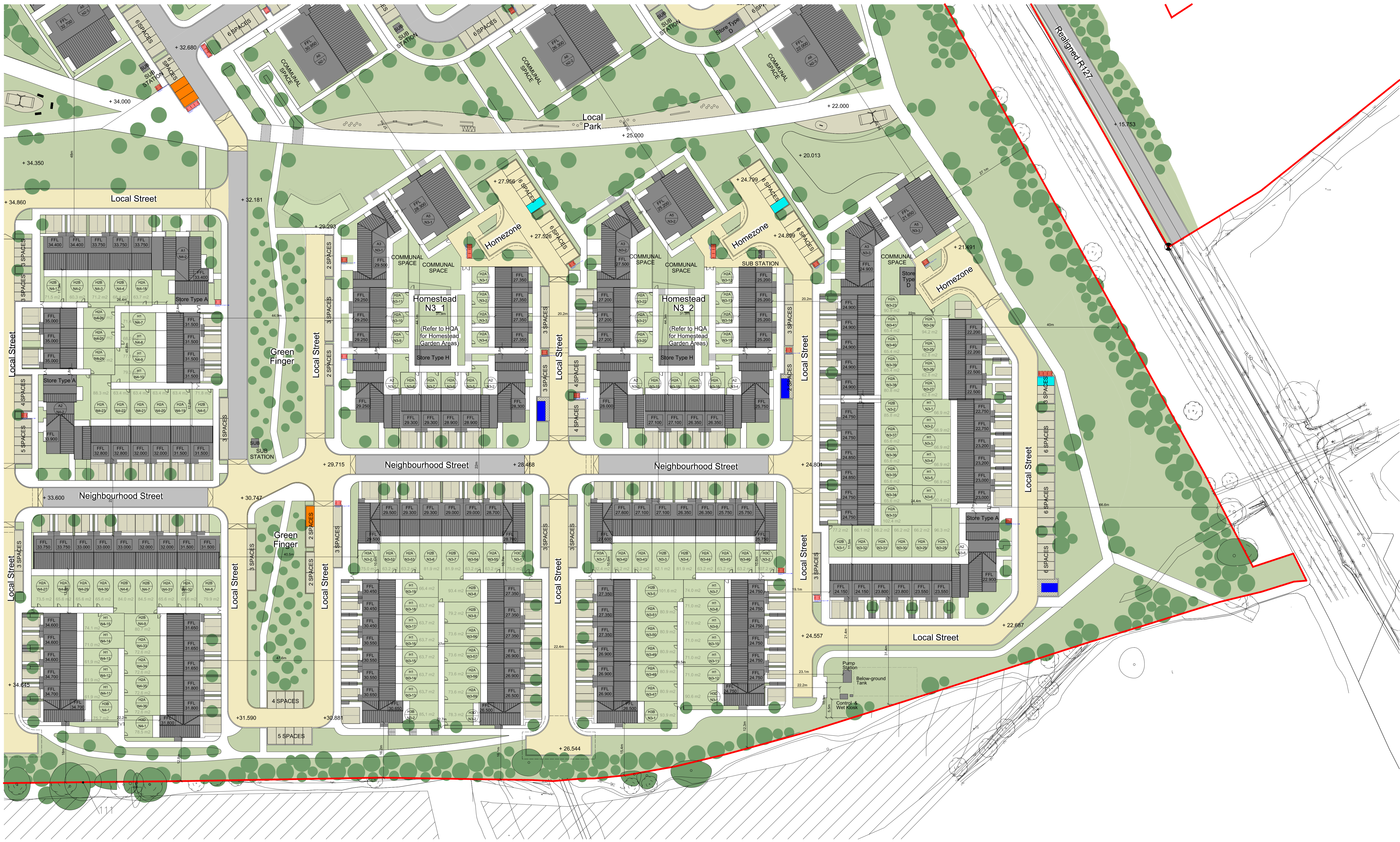
Proposed Site Layout Plan_Neighbourhood 3