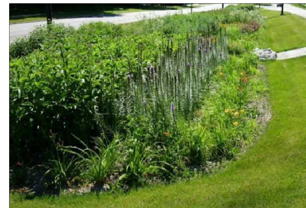
SuDS and Biodiversity