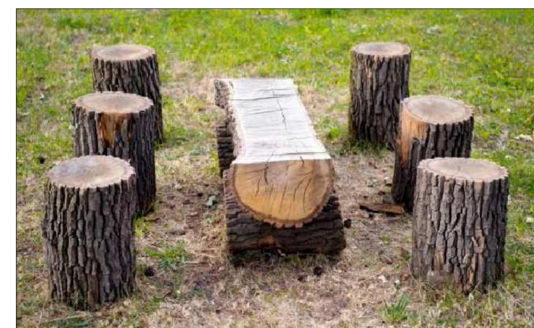
Natural Play / Seating