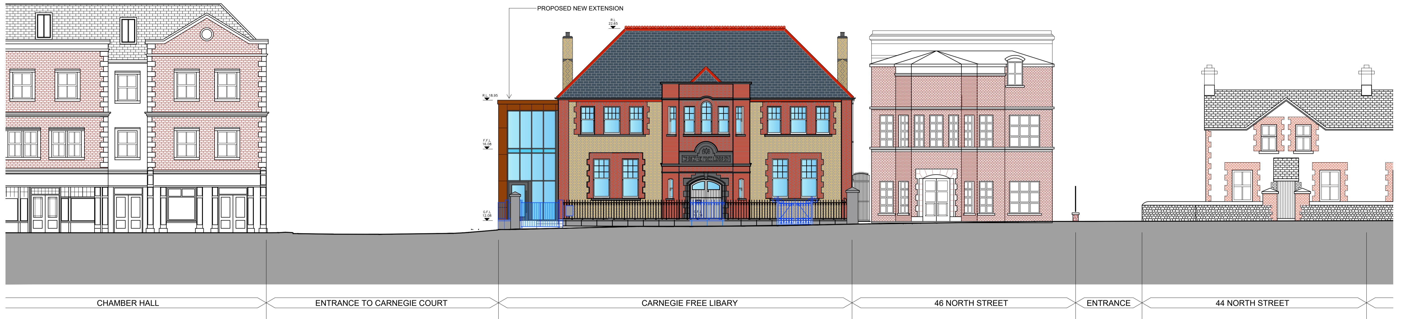
PROPOSED CONTIGUOUS STREET ELEVATION (NORTH STREET) - 1:100