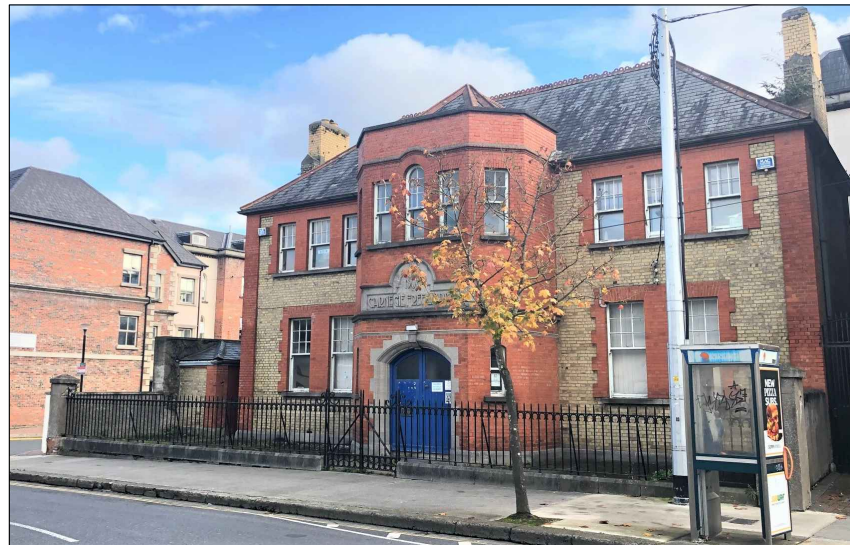
VIEW OF EXISTING STREET ELEVATION

General Notes: 1. USE FIGURED DIMENSIONS ONLY - DO NOT SCALE. 2. ANY DISCREPANCIES TO BE BROUGHT TO ARCHITECTS ATTENTION.