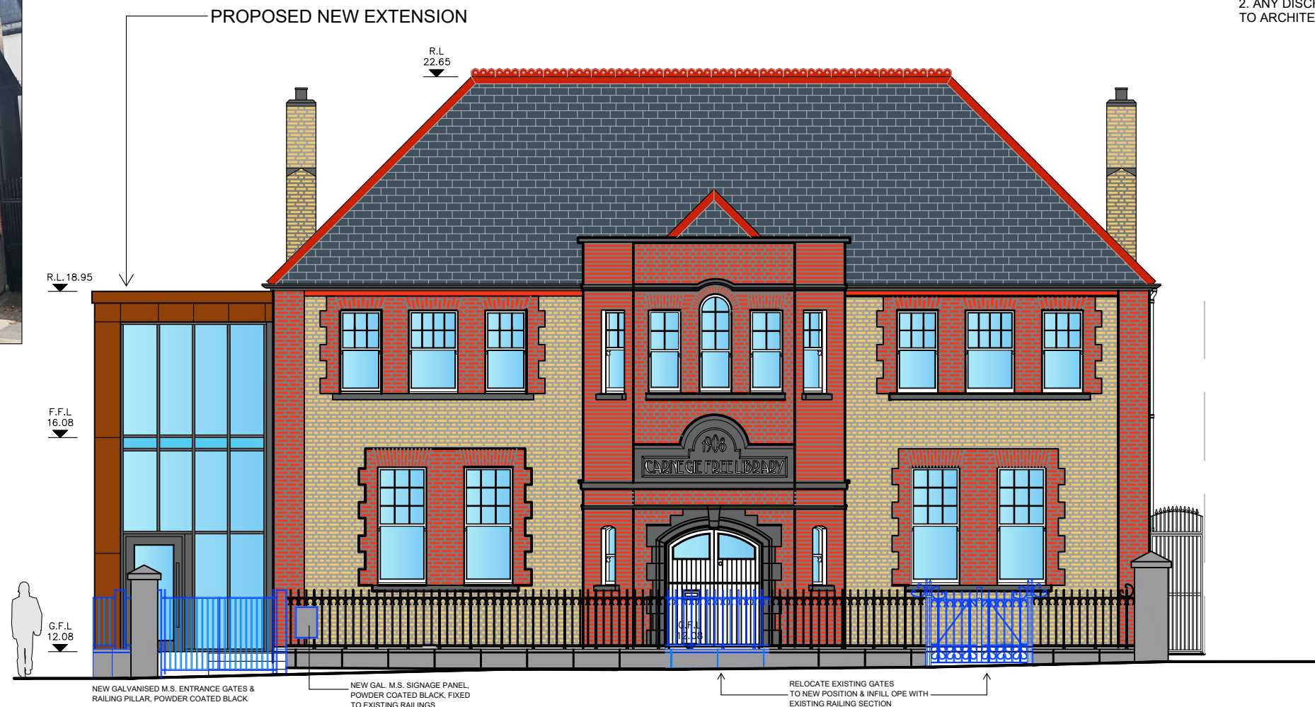
PROPOSED WEST / STREET ELEVATION SCALE 1:100

General Notes: 1. USE FIGURED DIMENSIONS ONLY - DO NOT SCALE. 2. ANY DISCREPANCIES TO BE BROUGHT TO ARCHITECTS ATTENTION.