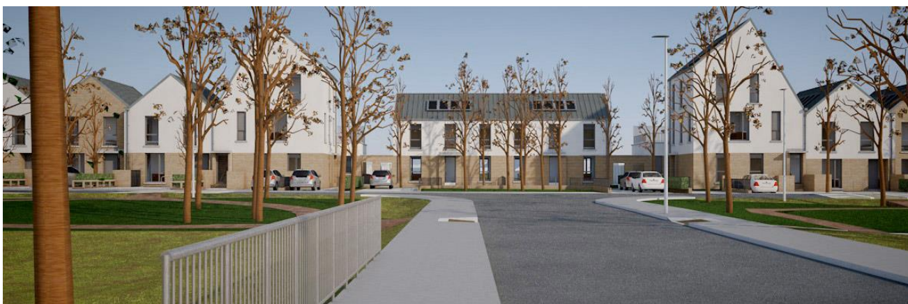
View approaching the north of stream units

landscaped square introduces a break in the terrace units, increasing view permeability and adding visual interest to the frontage.