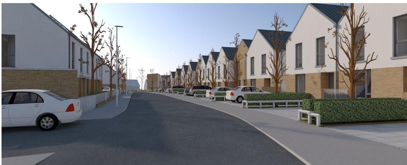
View along the entrance road in southern portion of site

The proposed main vehicular access from the Old Road is located off-centre in the narrow southern plot, leaving space for terraced housing blocks to the south-west along the road and semi-detached units in the proximity of the existing two storey houses on the south-east side. These latter houses have a shallow floor plan and have no overlooking windows to the rear at first floor level. The terrace blocks to the south west are broken up into three, and there is a balance between the two side of the road, with the narrower side containing semi-detached, narrow width, more sparsely distributed units. The terraces are further animated by the articulation of the 2-bedroom houses with a setback and change of material, and placement of bookend 2-bedroom houses or 3 storey units containing duplexes over apartments. The latter are employed at the majority of end terraces and the bookend 2-bedroom houses serve to announce the entrance to the development on Old Road.