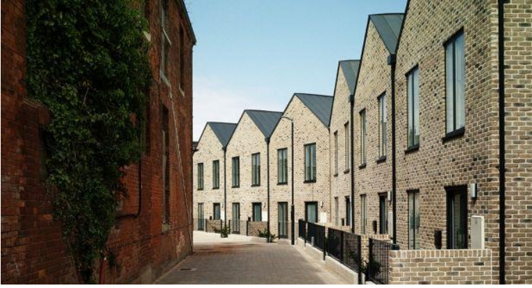
A2 Architects, St. George's Place Social Housing – form and material reference