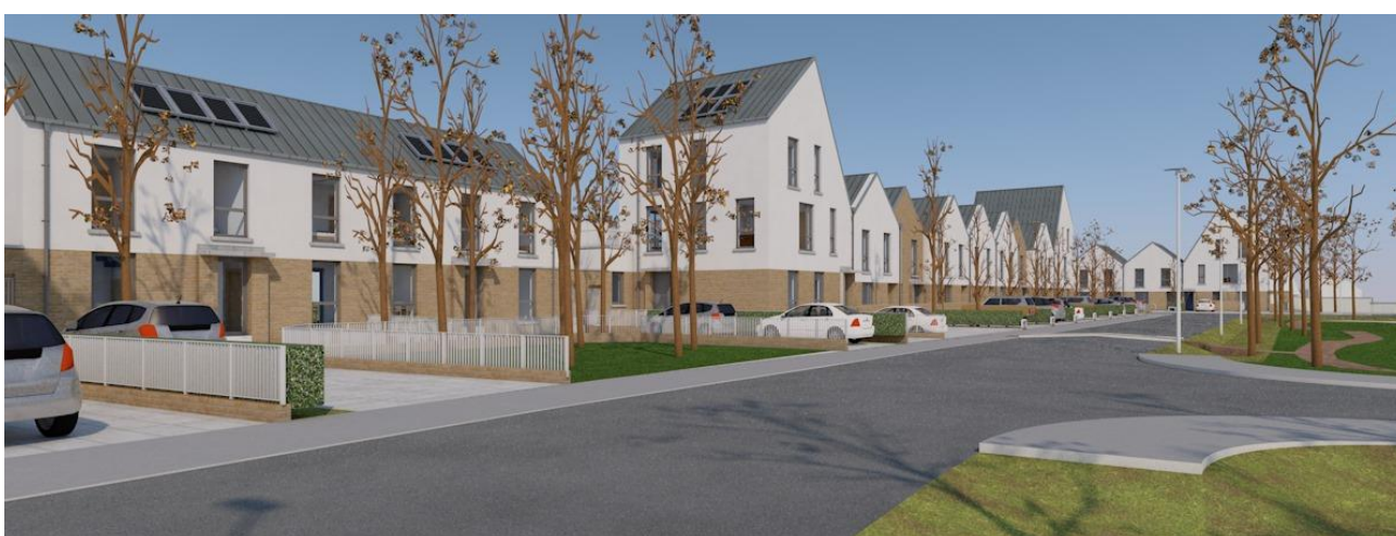
View from the North-Centre Rain Garden Public Open space

Typical house 7.2m deep frontages to houses with in-curtilage car parking allow for brick bin stores and a small area for planting to the front of the units and a narrow strip of planting between adjoining front gardens, with a columnar tree and shrubs serving as boundary line. The planted narrow strip ties in with the proposed drainage strategy. To the rear most of the units will have conventional back gardens, with grassed areas and hard surfaces to the external terraces connecting with interior living spaces.