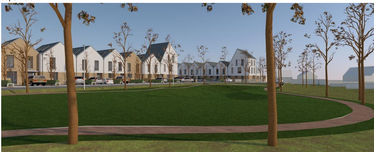
View from the Main Public Open Space

More than half of the units in the scheme address the green public open space, capitalizing on views and southerly aspects. All public open spaces are overlooked by surrounding homes so that the amenity is safe to use providing passive supervision.