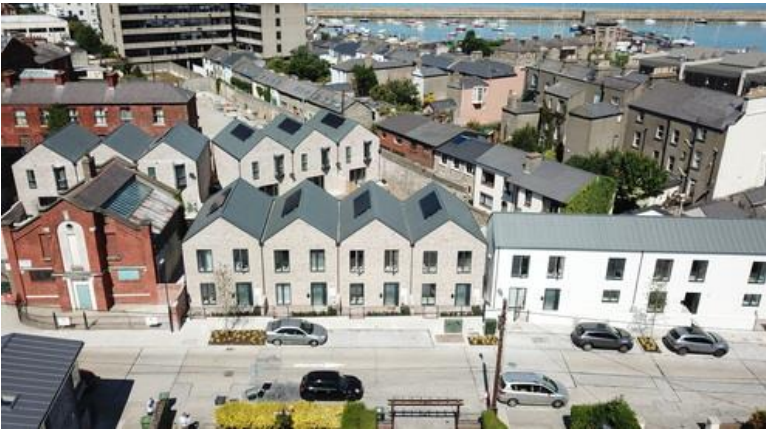
A2 Architects, St. George's Place Social Housing – form and material reference