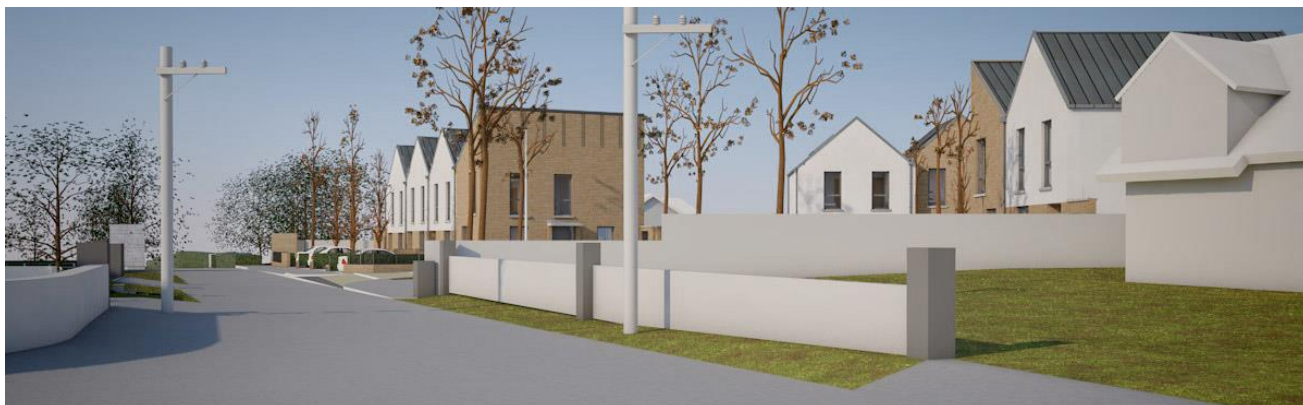
Context view along Old Road

The T-shape of the site, and the requirement to provide access from the Old Road, and the riparian zone of the stream have together determined the road layout and distribution of house blocks within the scheme, following the same T-shape.