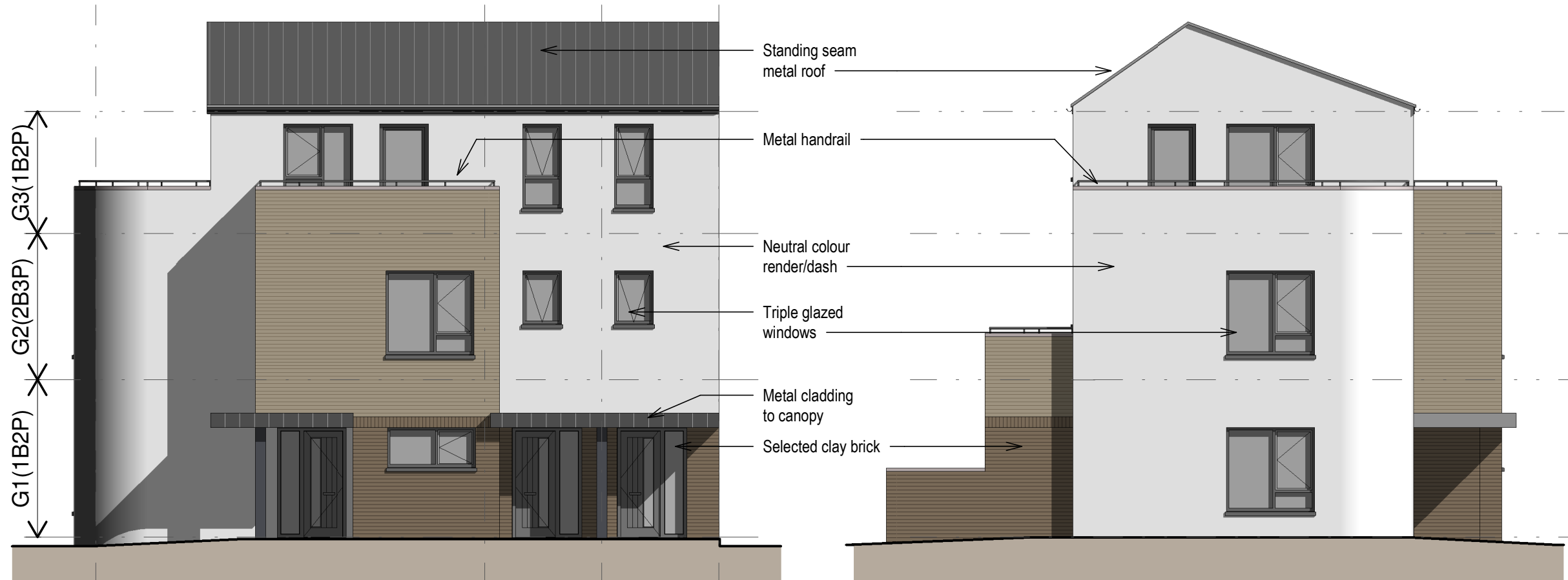
① Type G - Front Elevation 1 : 100