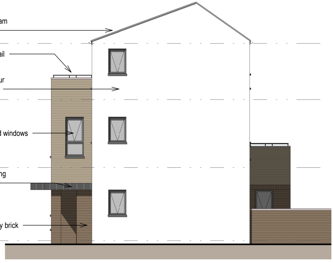
① Type F - Front Elevation 1 : 100

Standing seam metal roof Metal handrail Neutral colour render/dash Triple glazed windows Metal cladding to canopy Selected clay brick