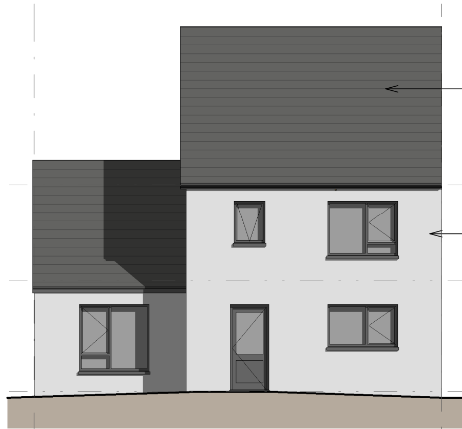
① Type D - Rear Elevation 1 : 100