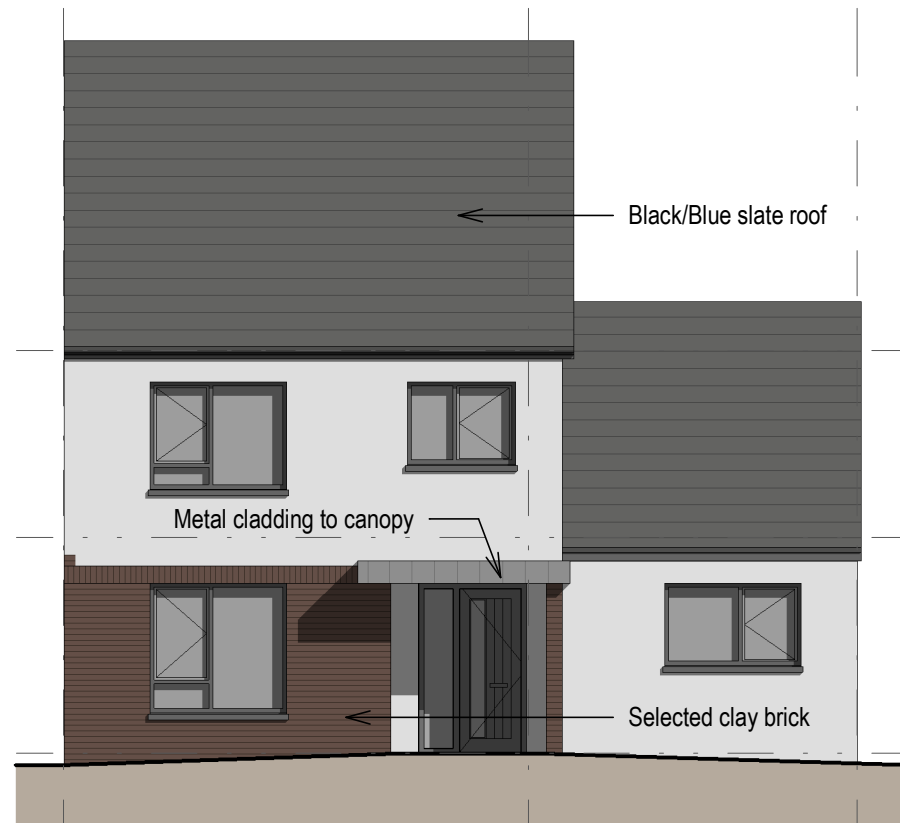
② Type D - Front Elevation 1 : 100