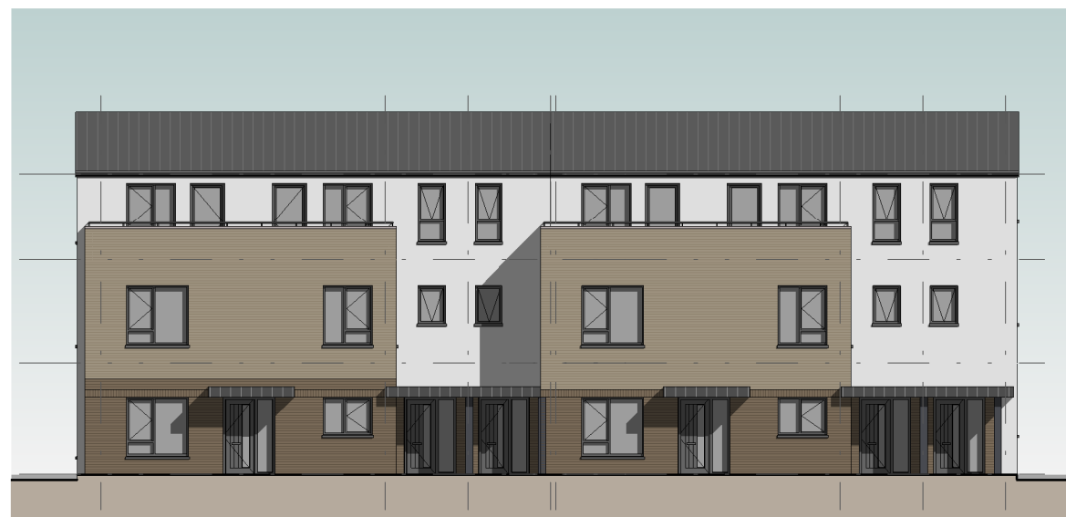
4 Block 10 Front Elevation 1 : 200