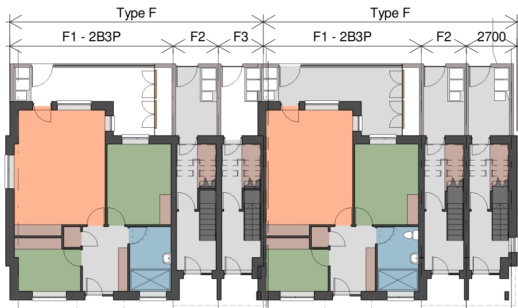
1 Block 10 Ground Floor Plan 1 : 200

Comhairle Contae Fine Gall Fingal County Council