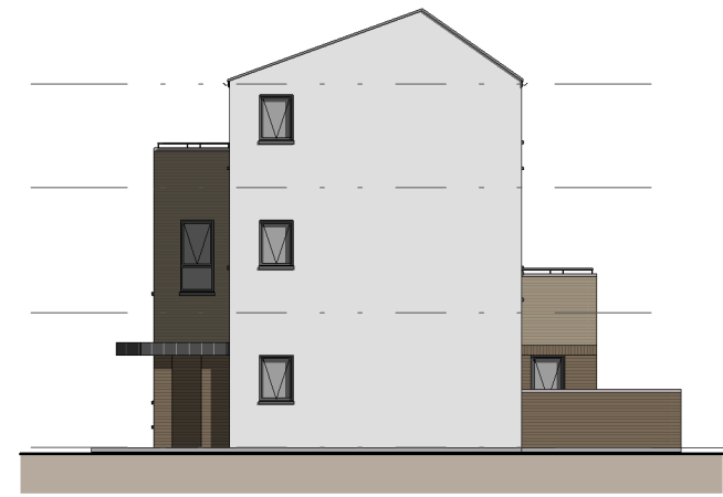
6 Block 10 Gable Elevation 1 1 : 200