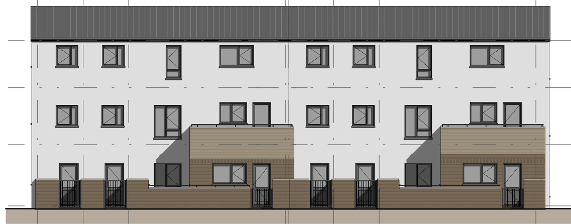
5 Block 10 Rear Elevation 1 : 200