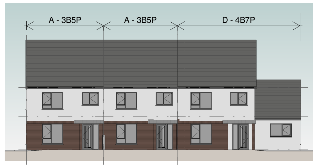
3 Block 7 & 11 Front Elevation 1 : 200

Comhairle Contae Fhine Gall Fingal County Council