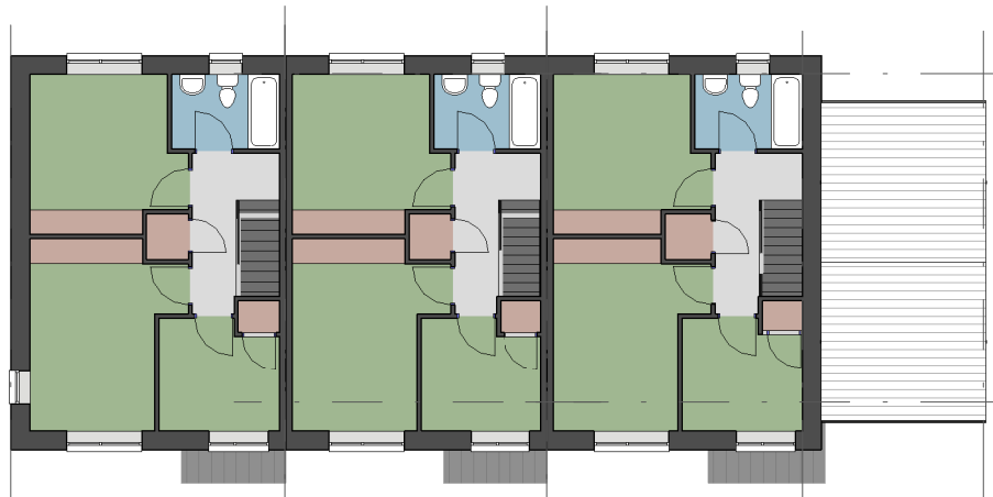
1 Block 7 & 11 First Floor Plan 1 : 200