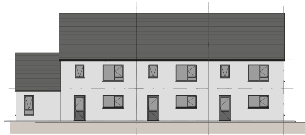
4 Block 7 & 11 Rear Elevation 1 : 200