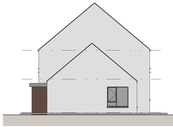
5 Block 7 & 11 Gable Elevation 1 1 : 200