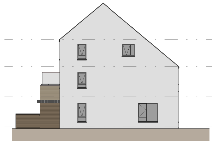
③ Block 3 & 4 Gable Elevation 1 1 : 200

for detailed dwelling layout refer to drg. no.'s 203 - 204 and 207 - 208