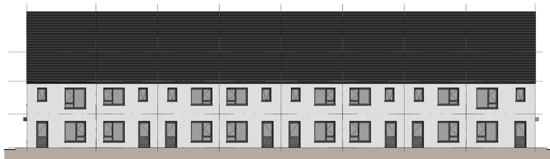
② Block 3 & 4 Rear Elevation 1 : 200