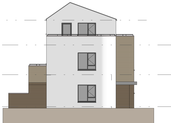
4 Block 1 & 9 Gable Elevation 2 1 : 200