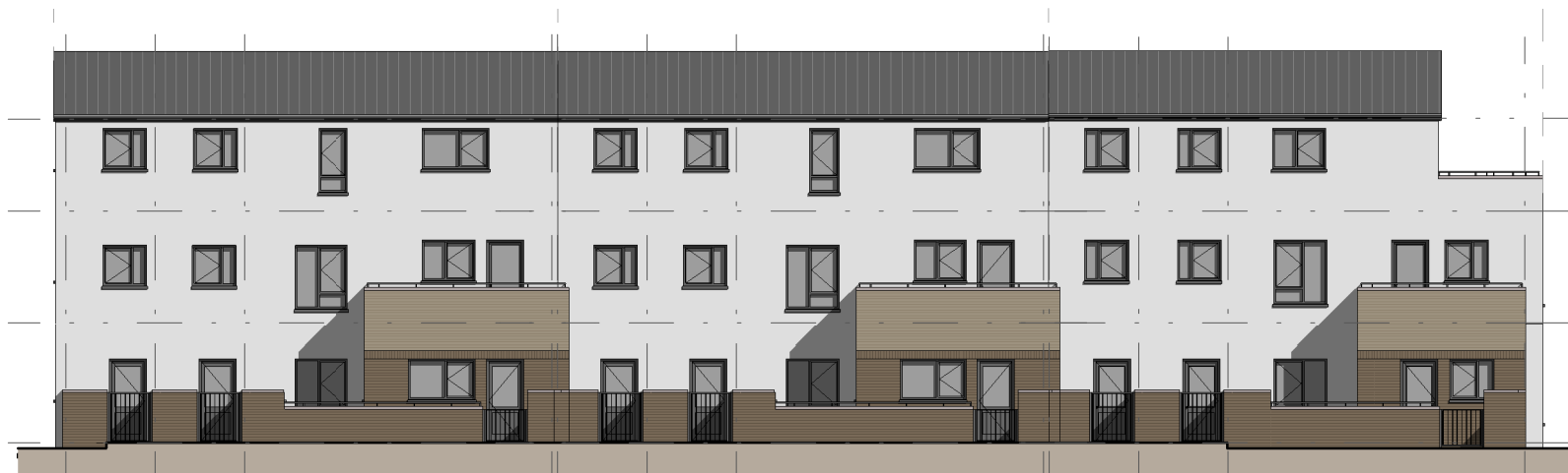
2 Block 1 & 9 Rear Elevation 1 : 200