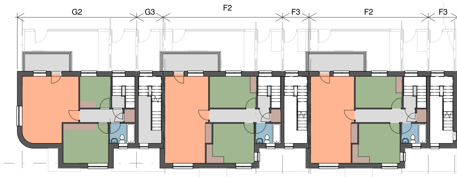
② Block 1 & 9 First Floor Plan 1 : 200