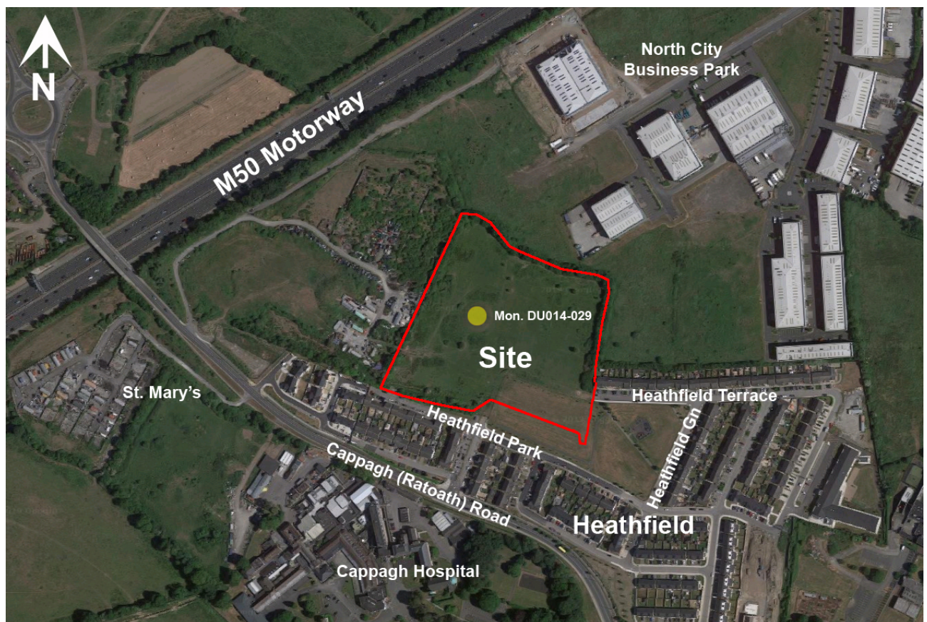
Figure 1: Site Location at Cappaghfinn (indicative red line – refer to accompanying planning documentation for full details)

A recorded monument – a ringfort (No. DU014-029) – is present within the site.