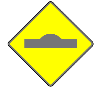
Road Signage Not to Scale

Comhairle Contae Fhine Gall Fingal County Council