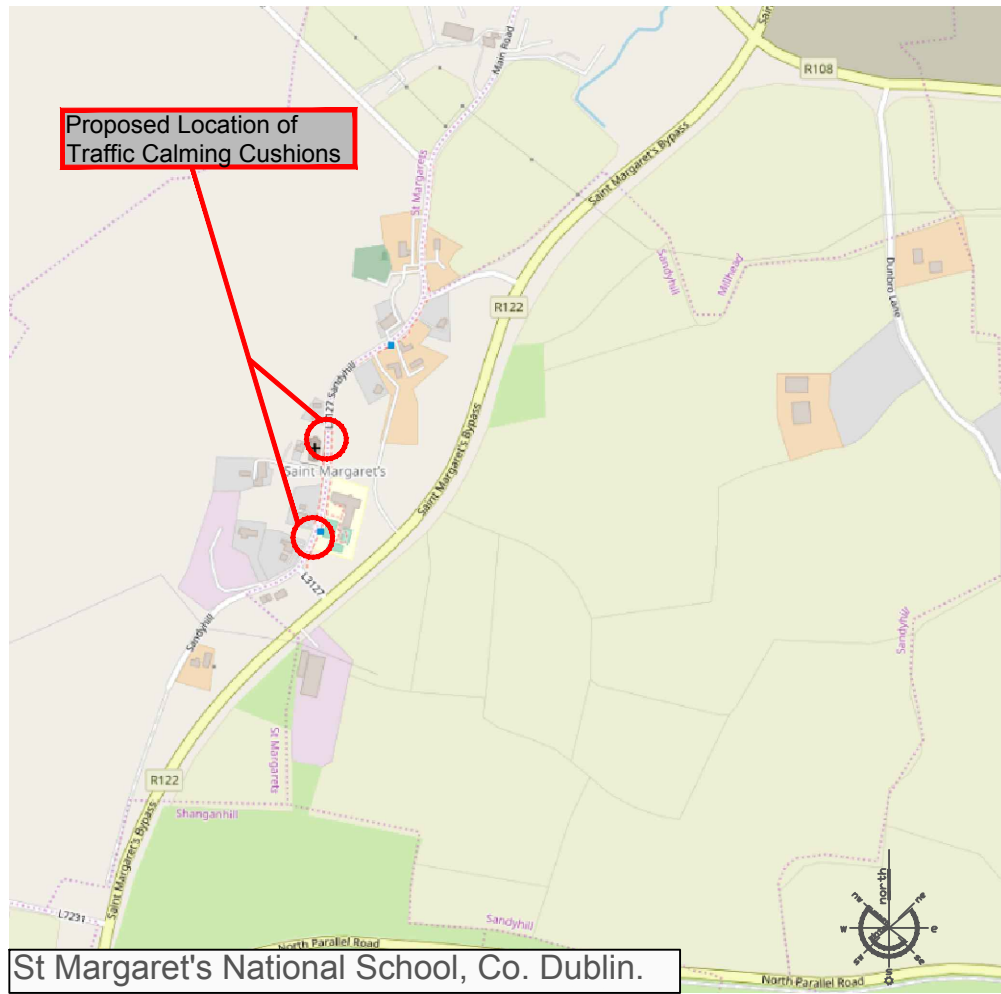
St Margaret's National School, Co. Dublin.