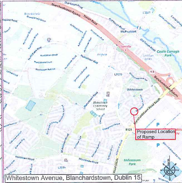
Whitestown Avenue, Blanchardstown, Dublin 15 Site Location Map Not to Scale