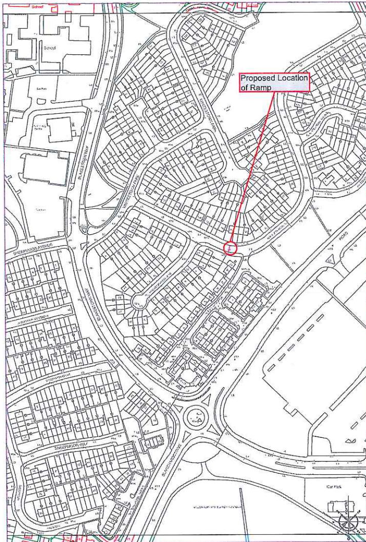
Site Layout Not to Scale