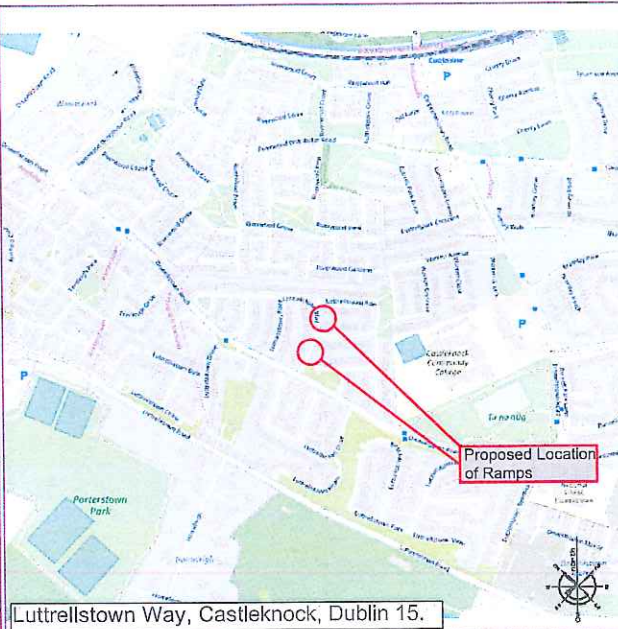
Luttrellstown Way, Castleknock, Dublin 15.