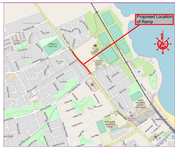
Site Location Map Not to Scale